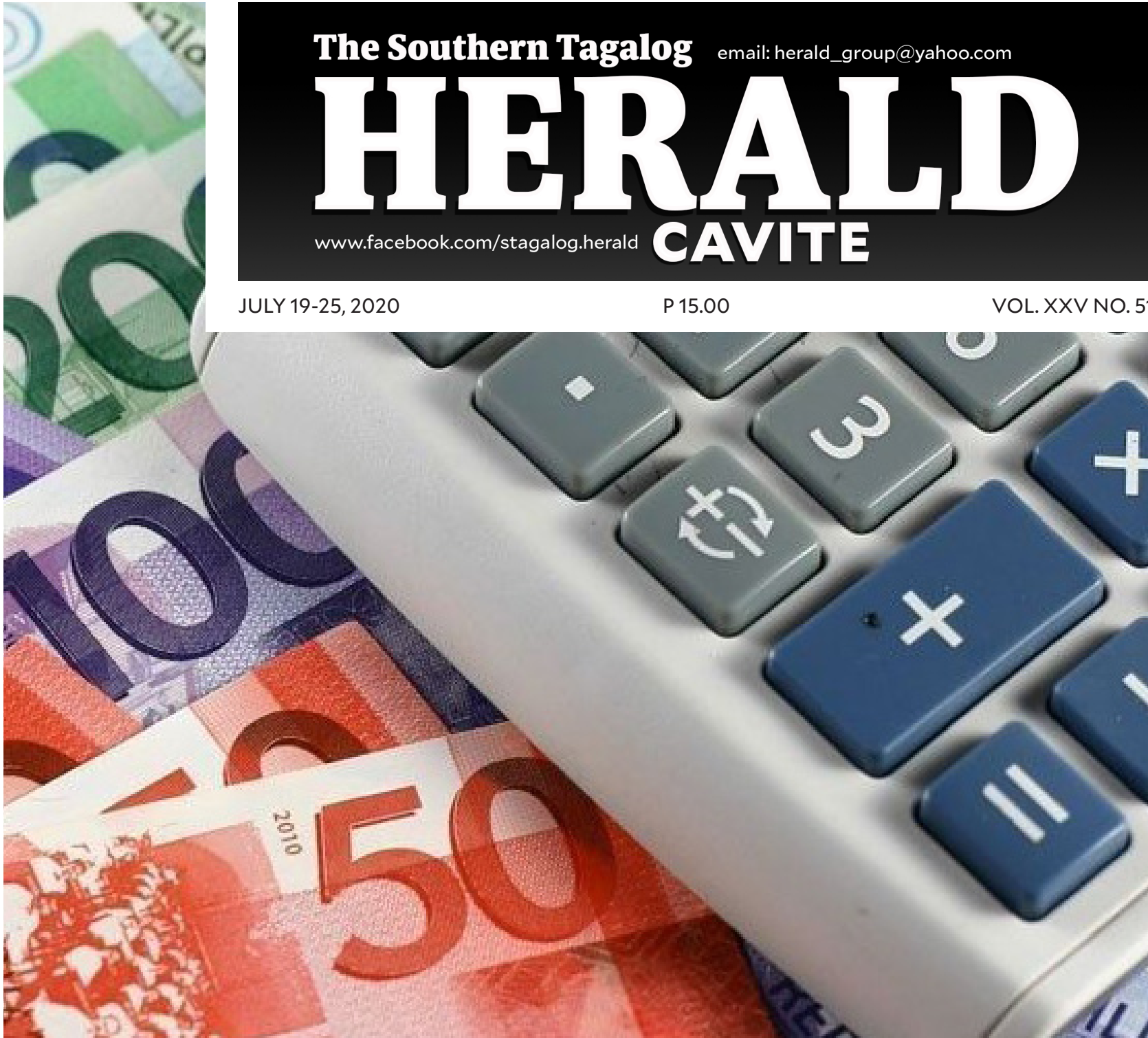
In a statement yesterday, DTI said the Small Business (SB) Corp., which administers the P1-billion COVID-19 Assistance to Restart Enterprises or CARES program, has released P22 million worth of loans to 286 beneficiaries as of July 8.