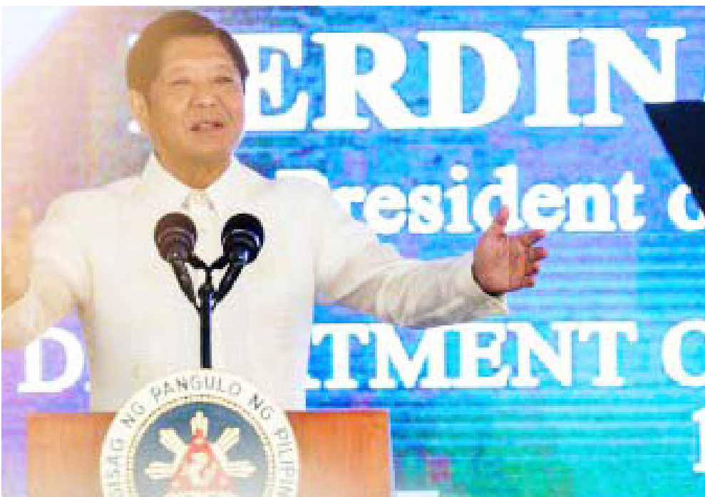
GOLDEN AGE OF INFRASTRUCTURE. President Ferdinand R. Marcos Jr. on Friday (June 23, 2023) graces the 125th anniversary celebration of the Department of Public Works and Highways at the department’s central office in Port Area, City of Manila. In his keynote speech, Marcos vowed to continue the “golden age of infrastructure” under his watch.

President Ferdinand R. Marcos Jr. pledged Friday to adopt his predecessor’s vision for “golden age of infrastructure” to enhance mobility and connectivity in the Philippines.