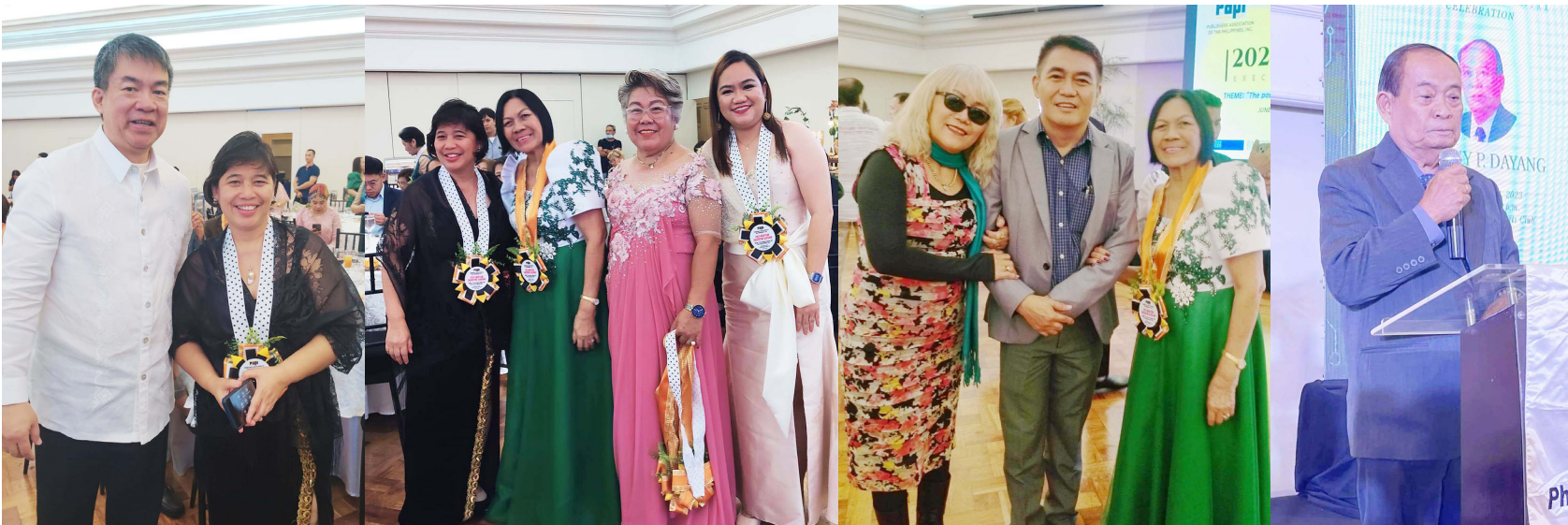
Sen. Koko Pimentel with Exec. Judge of Trece Martires City, Hon. Exec. Judge Flordeliz E. Cabanlit-Fargas