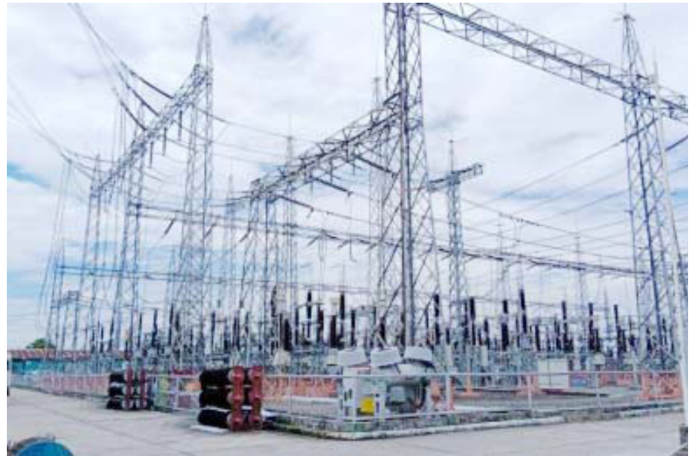
POWER UP. President Ferdinand R. Marcos Jr. inaugurated the new Mariveles-Hermosa-San Jose Transmission 500-kV project in Hermosa, Bataan on Friday (July 12, 2024). The Mariveles-Hermosa-San Jose Transmission Line will benefit about 59 million Filipinos in Luzon.

The President said the new transmission project "attests to the transformative power of collaboration between the public and the private sectors to be able to attain a stable, reliable, and