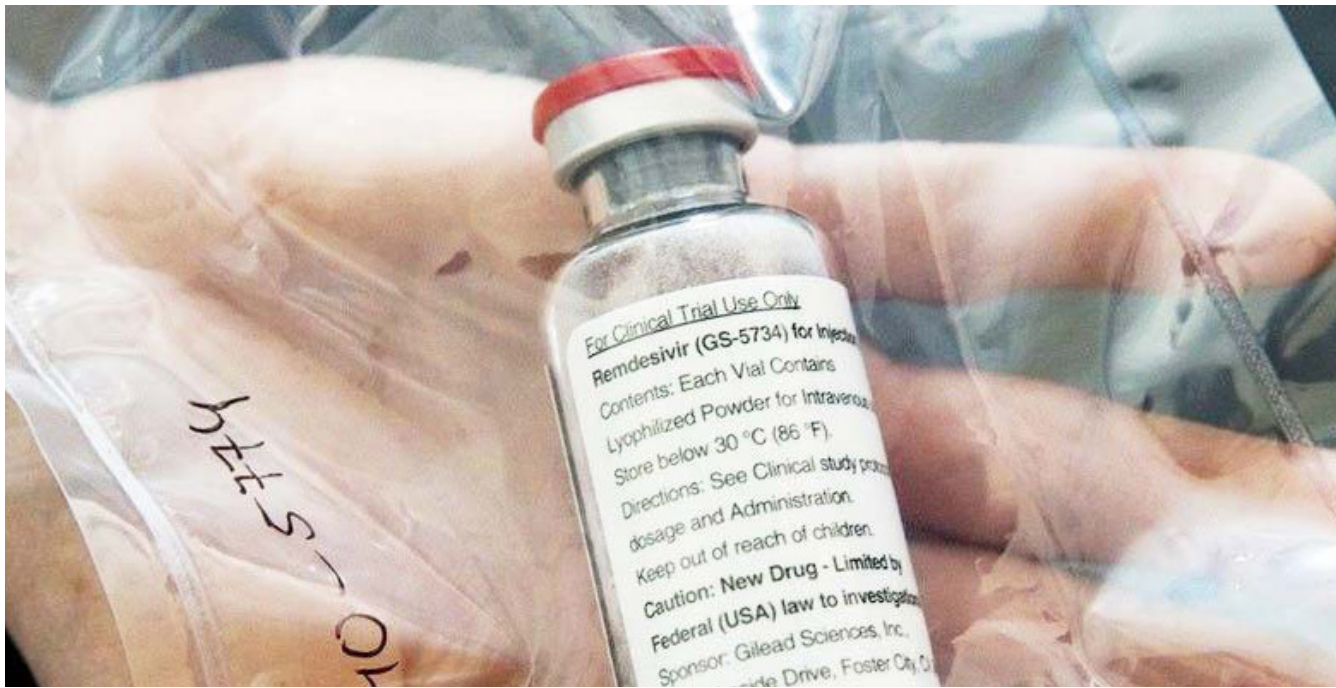
The NBI will look into patients' allegations that the Remdesivir vials were sold in these hospitals for P12,000 to P15,000, up to as high as P30,000 per vial.

The National Bureau of Investigation (NBI) has subpoenaed seven hospitals for allegedly overpricing the investigational antiviral drug against COVID-19. The NBI will look into patients' allegations that the Remdesivir vials were sold in these hospitals for P12,000 to P15,000, up to as high as