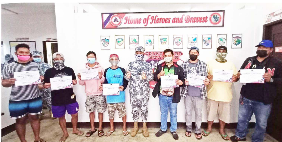
The Philippine Coast Guard (PCG) has lauded on Thursday, July 22, the eight fishermen that rescued at least 21 passengers from a capsized motorbanca in Corregidor Island.

The Philippine Coast Guard (PCG) has lauded on Thursday, July 22, the eight fishermen who rescued at least 21 passengers from a capsized motorbanca in Corregidor Island.