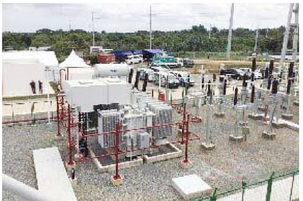
CAVITE'S FIRST SOLAR POWER PLANT This 64-megawatt solar power plant in Cavite, constructed by Prime Solar Solutions Corp. in Barangay Pantihan II, Maragondon, was inaugurated on July 17, 2024.