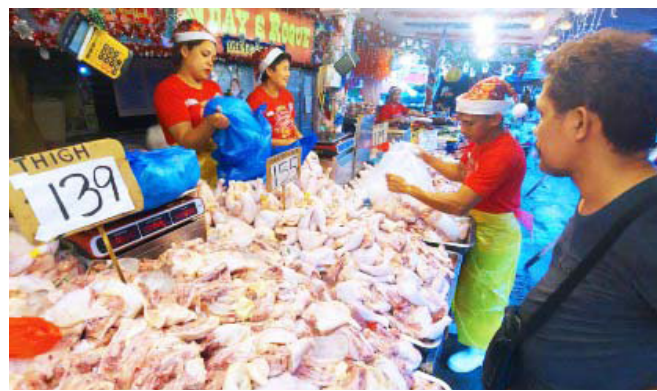
POSSIBLE PRICE MANIPULATION. Dressed chicken at the Bankerohan Public Market in Davao City in this photo taken on Dec. 20, 2023. The Department of Agriculture on Wednesday (July 17, 2024) warned unscrupulous traders who may be behind a possible price manipulation in a public market in Metro Manila where chicken is sold at up to PHP 250 per kg.

"Ang sinasabi nga ni Secretary (Francisco Tiu Laurel Jr.), ang puntirya rito, hindi lang kasi iyong nagtitinda per se, especially iyong nasa receiving end. Kailangang tingnan lahat iyong pinanggalingan, baka mamaya may nananamantala (What the Secretary said is that the target here is not only the sellers per se, especially those on the receiving end. We need to look at it from all the sources,