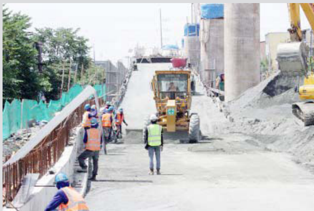
Construction site of the NLEX-SLEX Connector Project along Antipolo St. in Sampaloc, Manila

Three major projects under the Luzon High-Standard Highway Network are set to be completed this year, President Ferdinand R. Marcos Jr. said Monday.