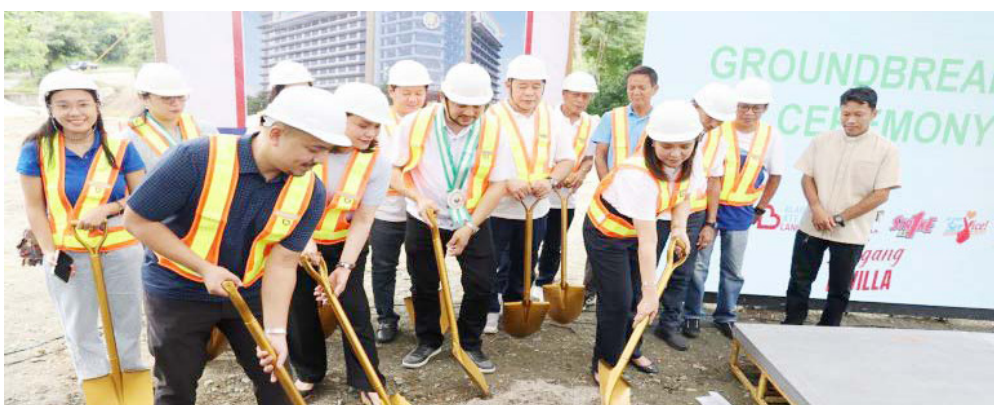
Ground being broken on the 12-storey building project. Credit: Republic of the Philippines DPWH.