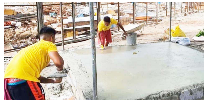
The Kabalik Hall Duty post/Multi-purpose area was constructed to provide BJMP personnel with more conducive work space and at the same time, utilize as multi-purpose area for service providers, visitors, and clientele.