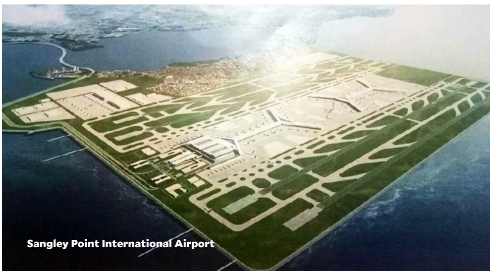
Sangley Point International Airport

CAVITE GOVERNOR Juanito Victor "Jonvic" C. Remulla has approved a request from Lucio C. Tan's MacroAsia Corp. and its Chinese partner for a further 90-day extension to complete the documentary requirements to post-qualify their bid for the $10-billion Sangley Point International Airport.