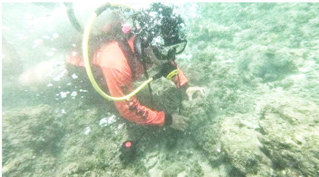
Personnel of the Philippine Coast Guard (PCG) and volunteer divers conducted sea grass monitoring and installed improvised marker buoys off Barangay Patungan, Maragondon, Cavite on Tuesday, June 15, 2021.

The PCG said the initiative aims to conserve and protect the natural resources of the province's vast waters.