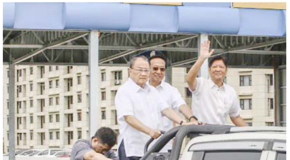
EASE TRAFFIC. President Ferdinand R. Marcos Jr. (waving) attends the inauguration of CAVITEX-C5 Link Sucat Interchange and later, the groundbreaking of the CAVITEX-CALAX Link and the CAVITEX-C5 Link Segment 3B, on Friday (June 21, 2024). The new segment is expected to enhance travel efficiency and ease commute for Filipinos, he said.