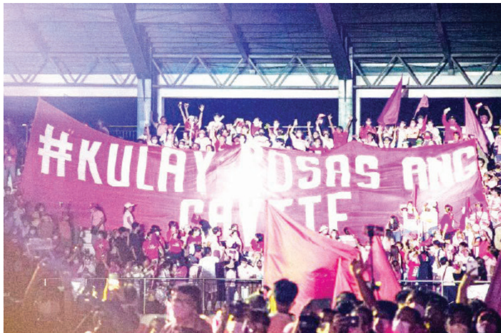
Supporters of Vice President Leni Robredo and her running mate Sen. Kiko Pangilinan flooded General Trias Sports Park in Cavite with pink, Friday, March 4, 2022