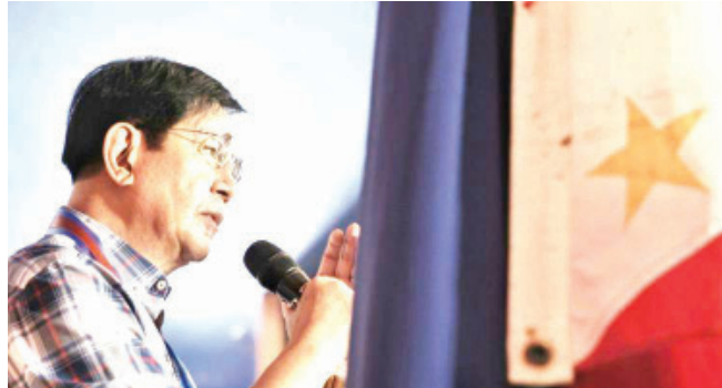
Presidential candidate Sen. Panfilo Lacson insisted Thursday that Vice President Leni Robredo's campaign rally in Cavite last week was infiltrated by communists, citing intelligence information that he had received. (FILE PHOTO)