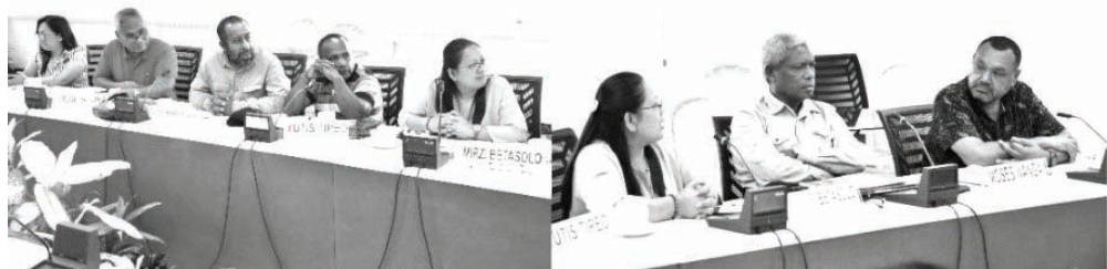
PNG delegates and PCAARRD officials during the briefing and meeting at the C.B. Perez Room, PCAARRD.

RD Innovation and Technology Center (DPITC) and the Seeds and Seedlings Plaza SciCAT Farm Tourism Site, which is a project of PCAARRD with Bureau of Plant