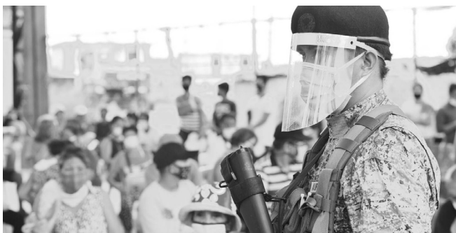
The local government of Gen. Trias requested the Philippine Air Force to support the PNP law enforcement in the city for the strict implementation of the ECQ protocols.

GENERAL TRIAS, Cavite May 6 (PIA) -- About 24 soldiers from the 730th Combat Group and 720th Special Operations Group of