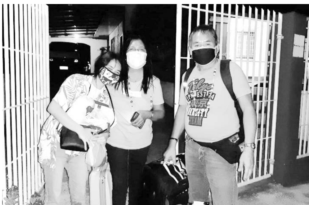
About 74 domestic tourists from the cities of Bacoor, Imus, Dasmariñas, General Trias and Trece Martires and the municipalities of Carmona and Silang stranded in the different cities and provinces in the country were flown in via domestic sweeper flights arranged by the Department of Tourism (DOT).

TRECE MARTIRES CITY, Cavite May 5 (PIA) -- The provincial government thru the Provincial Tourism and Cultural Affairs (PTCAO) and tourism offices of several LGUs recently assisted Caviteño domestic tourists stranded in different cities and provinces in the country. About 74 domestic tourists were flown in via domestic sweeper flights arranged by the Department of