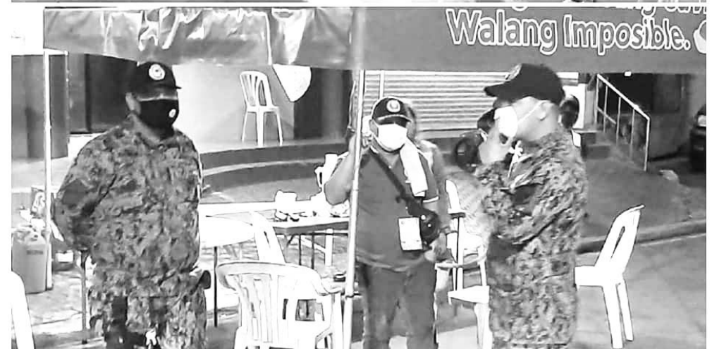
Police personnel in cities and municipalities implement stringent measures pursuant to PGC's 14-day Strict Community Quarantine.