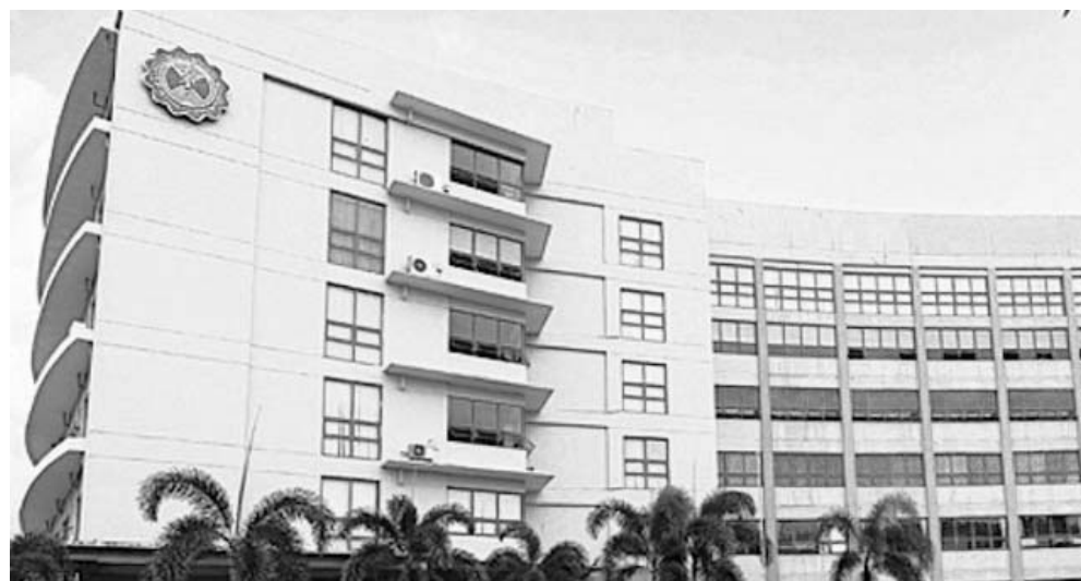
CERTIFIED CORONAVIRUS TESTING CENTER. The De La Salle Medical and Health Sciences Institute in Dasmariñas, Cavite.

The Department of Health (DOH) has certified the De La Salle Medical and Health Sciences Institute (DLSMHSI) in Dasmariñas, Cavite as a coronavirus testing facility.