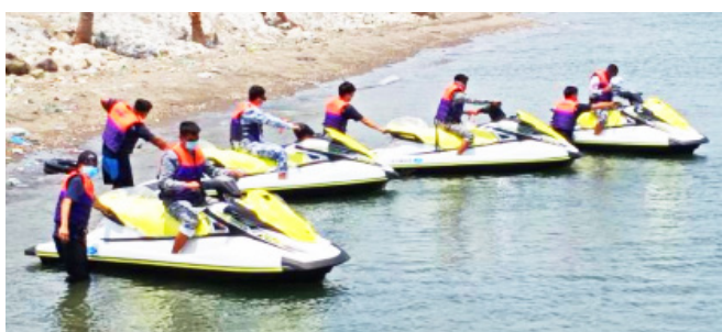
PERSONAL WATERCRAFT. The four jet skis donated by the provincial government of Cavite to the Philippine Coast Guard (PCG). The PCG on Wednesday (May 19, 2021) said the donated maritime assets will be used to help uphold maritime laws and in search and rescue operations.