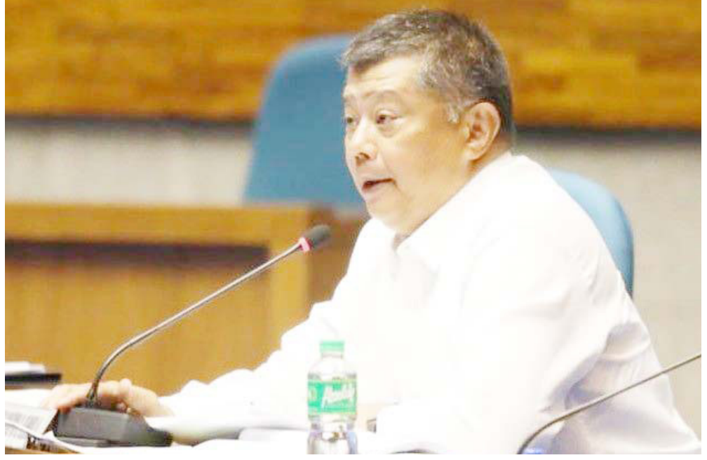
This photo shows Rep. Jesus Crispin Remulla (Cavite).

Rep. Remulla of Cavite calls the recantation of three witnesses in the De Lima case a "red flag."