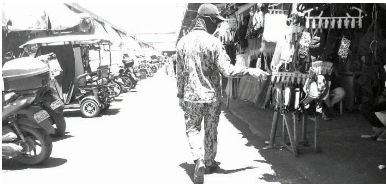
Pulis sa Palengke' ensure ECQ protocols are observed during market day in Imus Palengke.