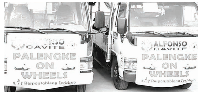
Palengke on Wheels will continue to provide Alfonsoños safe access to food under the SSE-ECQ effective May 3 - 15, 2020.