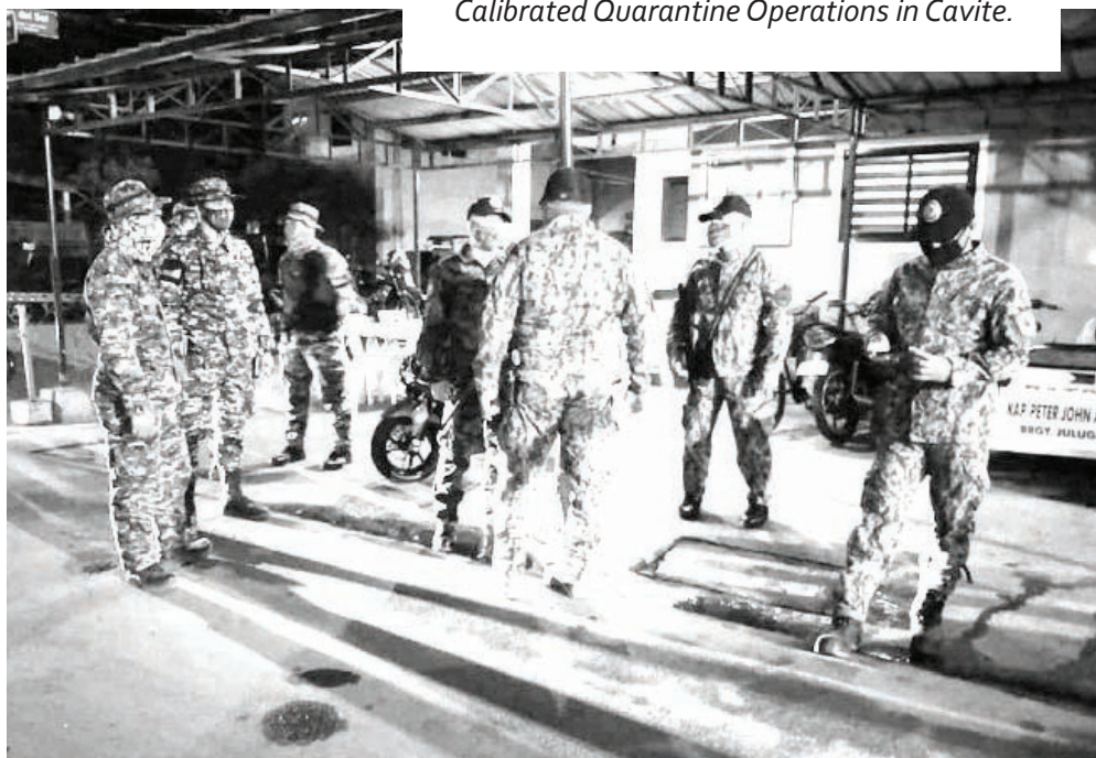
TRECE MARTIRES CITY, Cavite Apr. 29 (PIA) -- Hours after Cavite Governor Jonvic Remulla declared a 14-day strict quarantine for the entire province of Cavite, he announced the implementing guidelines for the Calibrated Quarantine Operations.

Additional AFP personnel were asked to be deployed for the implementation of the Calibrated Quarantine Operations in Cavite.