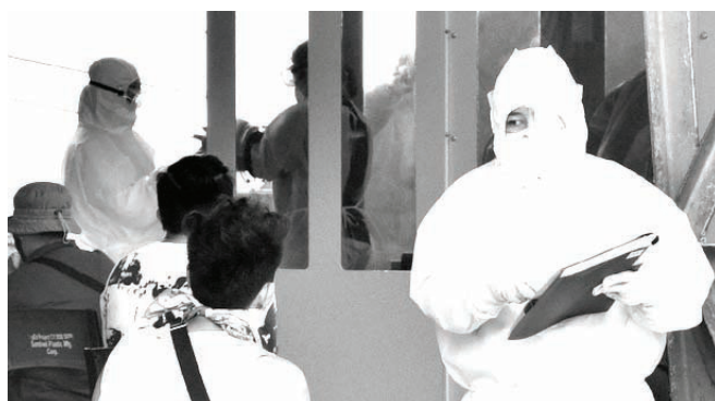
TARGETED TESTING. Cavite conducts targeted testing among residents considered 'high vectors of disease' after completing tests among probable cases.

Cavite province is setting up additional coronavirus testing laboratories to achieve a testing capacity of up to 15,000 tests a day.