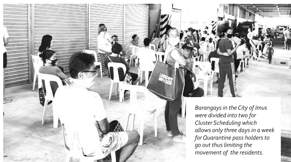
Barangays in the City of Imus were divided into two for Cluster Scheduling which allows only three days in a week for Quarantine pass holders to go out thus limiting the movement of the residents.

IMUS CITY, Cavite Apr. 29 (PIA) -- Imus City Mayor Emmanuel L. Maliksi conveyed the Cluster Scheduling, a more stringent measure for the implementation of the Extended Extreme Enhanced Community Quarantine (EE-ECQ) in the city.