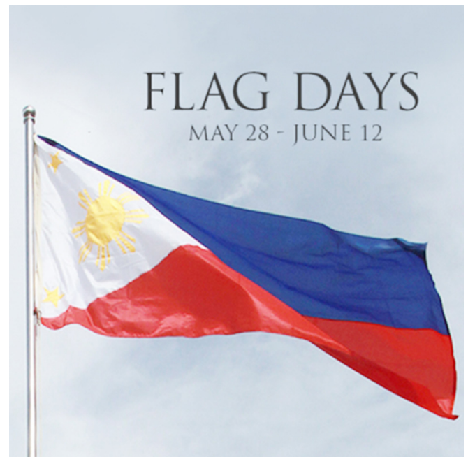
The Philippine Flag was first unfurled May 28, 1898 by Filipino revolutionaries after a hard-fought encounter against the Spanish force prior to the proclamation of the Philippine independence on June 12, 1898 by Gen. Emilio F. Aguinaldo.

IMUS CITY, Cavite May 29 (PIA) -- This year's celebration of the National Flag Day which commemorates the 122nd year the Philippine Flag was first unfurled May 28, 1898 was both somber and solemn with its simplicity.