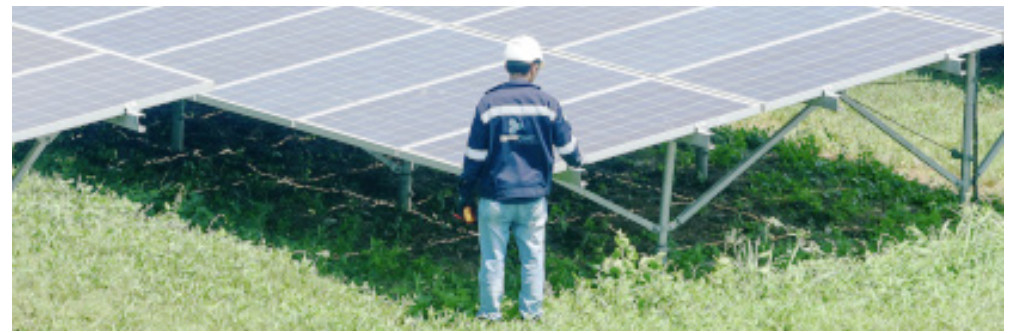
NEW SUPPLY. A solar power project of Aboitiz Power Corp. in this undated photo. The Department of Energy said on Thursday (April 25, 2024) that half of the new power supply coming online this year will come from solar power projects. (File photo)

Based on the DOE's demand projection for 2024, the peak power demand will be hit around Week 20 of