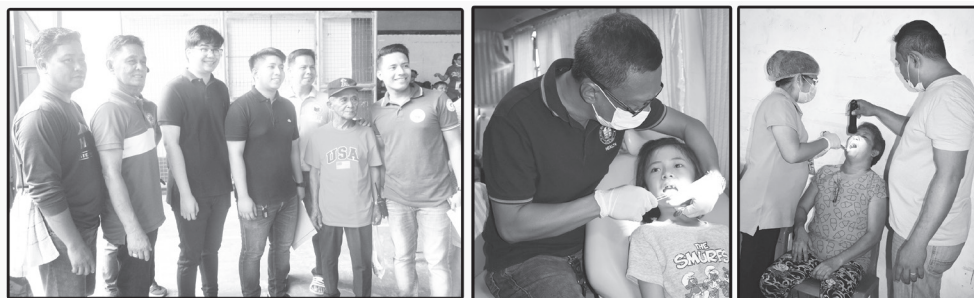
Medical and Dental Mission Barangay Buenavista III

Recognizing the importance of good health and wellbeing of the constituents, Governor Jonvic Remulla thru the Office of the Provincial Governor-Extension remains steadfast in conducting free healthcare