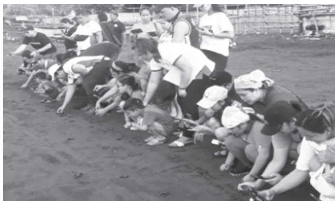
SAVING SEA TURTLES. A total of 72 marine turtle hatchlings have been released at Barangay Labac shoreline in Naic, Cavite on Nov. 4, 2019. Female marine turtles normally lay eggs three to five times over a two-week interval during the breeding season from November to February.

NAIC, Cavite – A total of 72 "pawikan" (marine turtle) hatchlings have been released on Sunday at their natural marine habitat along the shorelines of Barangay Labac in this coastal town.