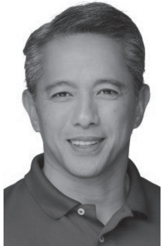
Governor Jonvic Remulla

Recognizing the importance of good health and wellbeing of the constituents, Governor Jonvic Remulla thru the Office of the Provincial Governor-Extension remains steadfast in conducting free healthcare