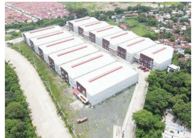
AYALALAND Logistics Holdings Corp. (ALLHC) recently unveiled the third phase of its industrial park in Naic, Cavite.

The company expects on-going infrastructure projects to improve the industrial park’s accessibility and connectivity. These projects include the Cavite-Laguna Expressway (CALAX), the Manila-Cavite Expressway (CAVITEX) extension, the Cavite-Tagaytay-Batangas Expressway (CTBEX), and the Bataan-Cavite Interlink Bridge.