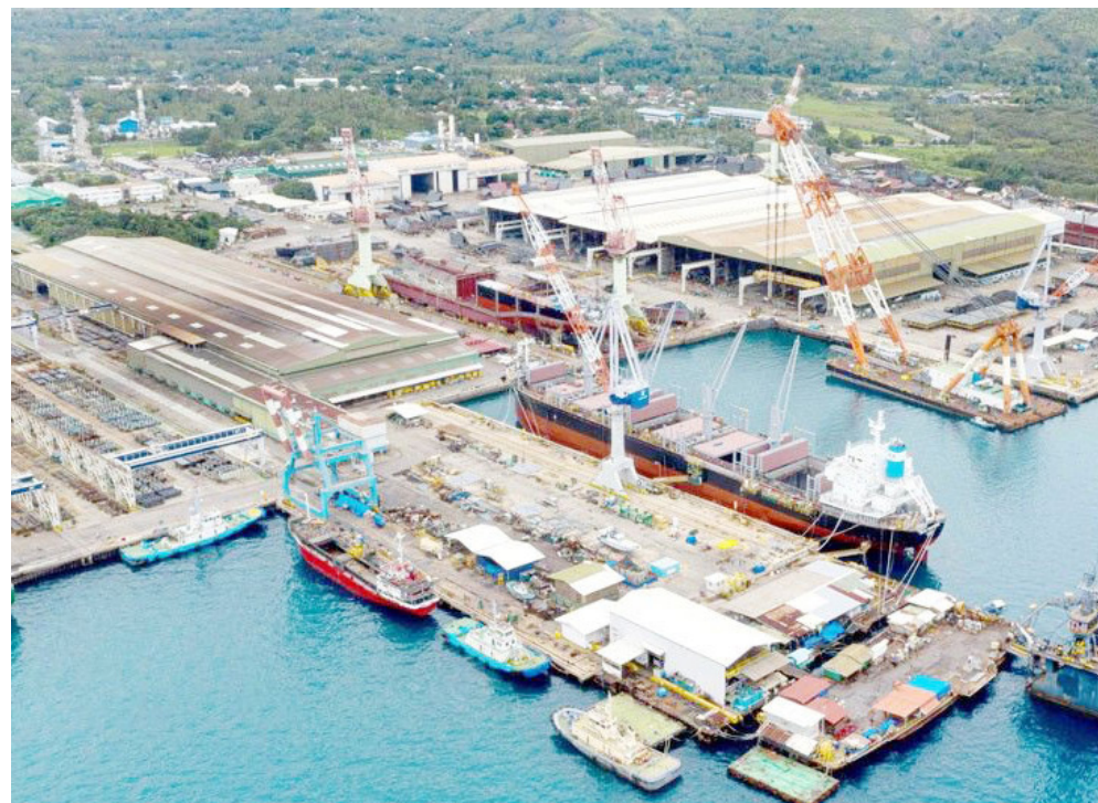
Tsuneishi Heavy Industries started developing land and construction of shipbuilding facilities in 1994. Today, it has grown to become one of the largest shipbuilding factories in the Philippines with the capacity to build about 20 vessels per year.