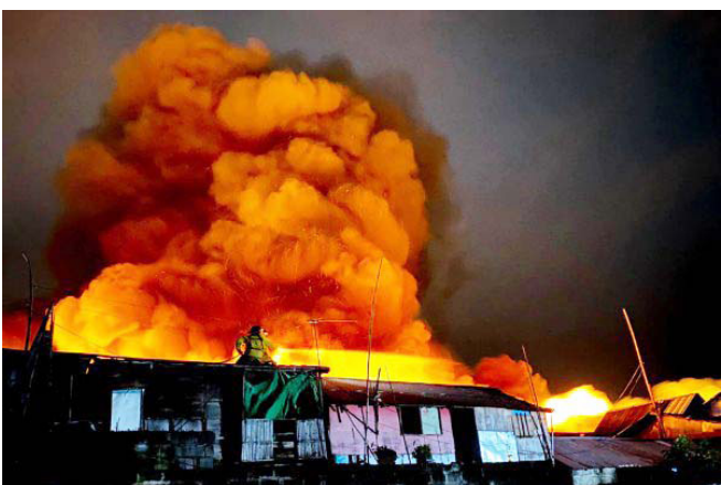
Isang bomberong rumeresponde sa sunog sa residential area sa Bacoor, Cavite noong gabi ng Nobyembre 1, 2020. Sumiklab ang sunog kasunod ng pananalasa ng bagyong Rolly sa lalawigan noong parehong araw.

Isang bomberong rumeresponde sa sunog sa residential area sa Bacoor, Cavite noong gabi ng Nobyembre 1, 2020. Sumiklab ang sunog kasunod ng pananalasa ng bagyong Rolly sa lalawigan noong parehong araw. Bagyong Rolly ang pinaghan