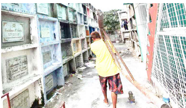
Cemetery personnel start cleaning the cemetery in Tejero, Rosario, Cavite.

IMUS CITY, Cavite — To avoid the spread of coronavirus disease, Cavite police will strictly enforce the guidelines issued by Gov. Juanito Victor 'Jonvic' Remulla Jr for the commemoration of All Saints and All Souls Day amid the pandemic. This as the national government had earlier issued