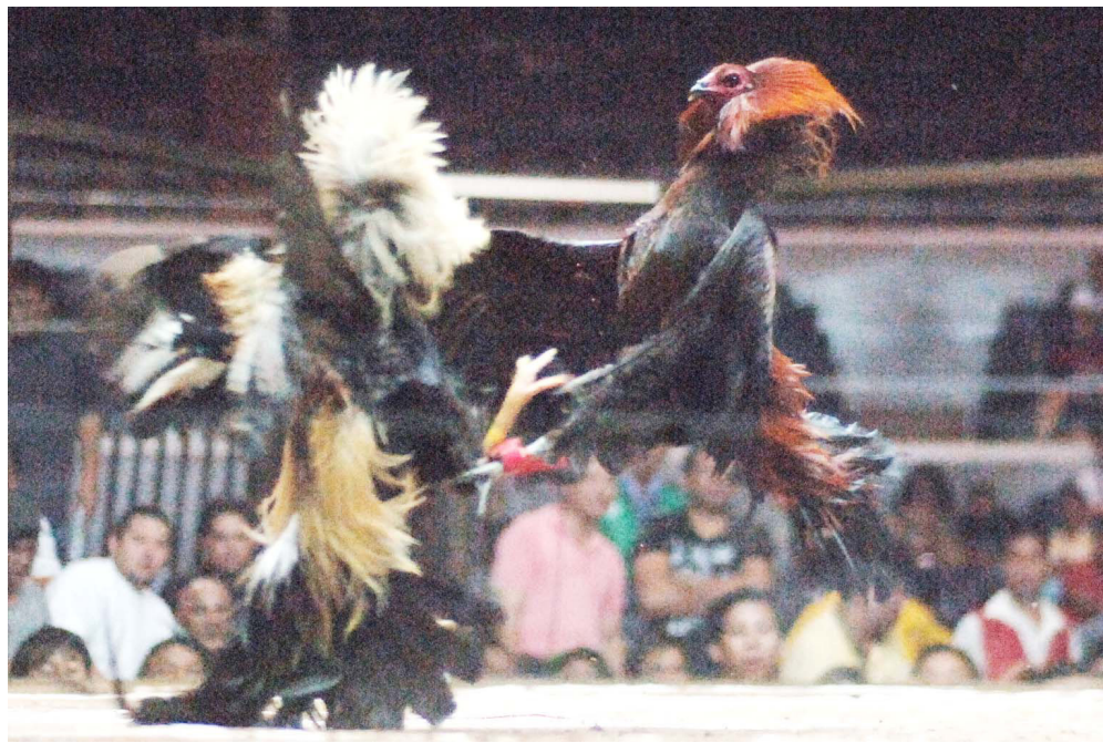
POPULAR PASTIME Cockfighting, a legal form of gambling, remains a popular pastime, especially in the provinces where cockpit arenas have become community fixtures.

Cavite is under MGCQ from Oct. 1 to 31 to reopen the economy and control the spread of new COVID-19 cases. Oct. 20 data from the Department of Health's COVID-19 tracker showed that Cavite has 19,291 total confirmed cases, 16,521 recoveries, and 171 deaths.