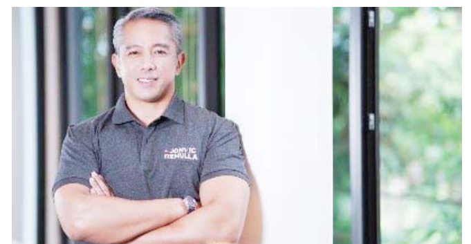
Governor Jonvic Remulla says they are preparing a budget to hire on a temporary basis graduates of an education course, and those displaced by the closure of private schools in Cavite.