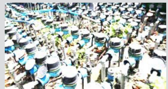
Senate approves Maynilad, Manila Water franchise bills

The Senate has approved on third and final reading the renewal of the 25-year franchises of water concessionaires Manila Water Co. Inc. and Maynilad Water Services Inc.