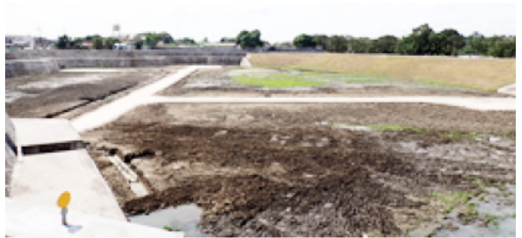
The Imus Retarding Basin

The Imus Retarding Basin includes an 84-meter