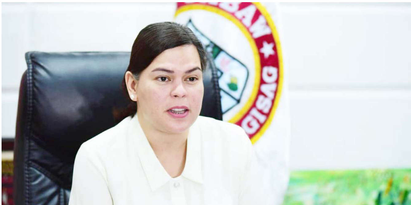
Davao City Mayor Sara Duterte-Carpio

A lawmaker who is a member of the Liberal Party on Friday threw his support behind the possible presidential candidacy of Davao City Mayor Sara Duterte-Carpio. >> P2