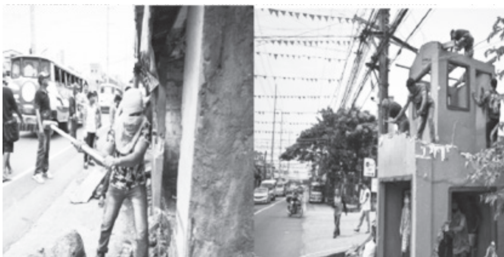
ROAD CLEARING OPS. Clearing operations teams of General Trias City remove the illegal structures on sidewalks along the Antero Soriano Highway in Barangay Bacao in compliance with President Duterte’s order to reclaim public roads from private use and rid the streets from illegal structures and obstructions, in one of the massive clearing operations on Sept. 9, 2019.

GENERAL TRIAS CITY, Cavite – With 16 days more to go before the Sept. 29 deadline, Cavite’s 16 towns and seven cities are now in the homestretch in their respective public road clearing in compliance with President Rodrigo Duterte’s directive to reclaim public roads from private use and remove illegal structures and obstructions.