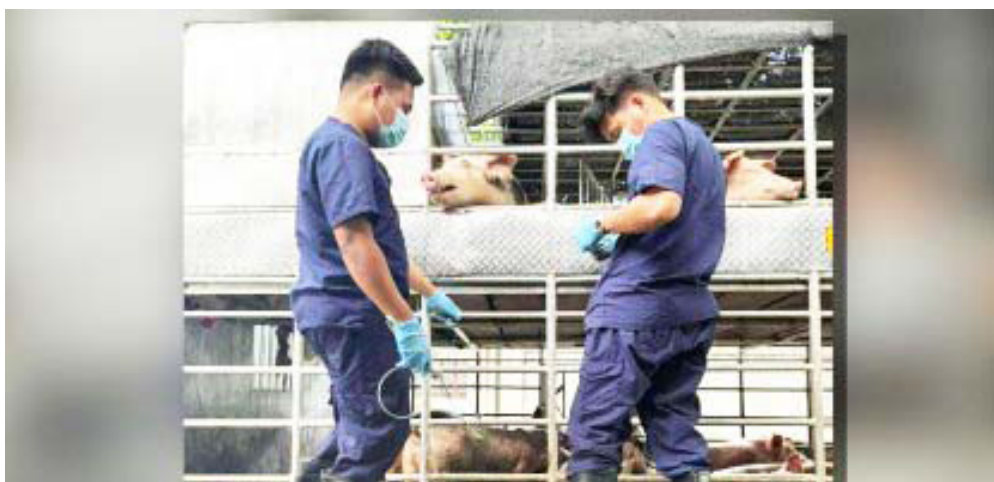
SEIZED HOGS. Personnel of the Bureau of Animal Industry seize 60 hogs at the Tandang Sora checkpoint in Quezon City after its transporters failed to present valid documents on Aug. 15, 2024. Agri Party-list Rep. Wilbert T. Lee on Thursday (Aug. 22) urged the Department of Agriculture to establish more biosecurity and surveillance checkpoints along major roads and seaports to curb the spread of African swine fever in the country.