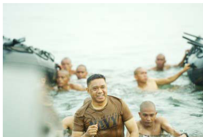
'HONORARY NAVY SEAL'. AFP chief Gen. Romeo Brawner Jr. joins the drills for the Navy Seals rites at Sangley Point, Cavite on Monday (Aug. 19, 2024). The specialized naval warfare drills include rigorous warm-up exercises, boat paddling, swimming, one-mile run, and firing of .45-caliber pistol and sniper rifle.

The NAVSOCOM, known for its role in unconventional warfare, conducts operations involving demolition, intelligence, and underwater tasks, primarily fo-