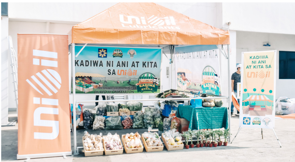
The Department of Agriculture (DA) Region 4A in partnership with the Department of Energy (DOE) and UniOil recently rolled out its KAtuwang sa DIwa at GaWA (KADIWA) ni Ani at Kita Project on Wheels at UniOil Anabu 1 and UniOil Anabu 2, Imus City, Cavite.

Metro Pacific Tollways Corp. (MPTC) has rolled out RFID payments across 75 percent of its network, adding it is on track for full electronic payments by November 2 this year. This was in line Transportation secretary Arthur Tugade's directive for toll operators to have 100 percent electronic toll collection by the deadline in a bid to slow the spread of COVID-19.