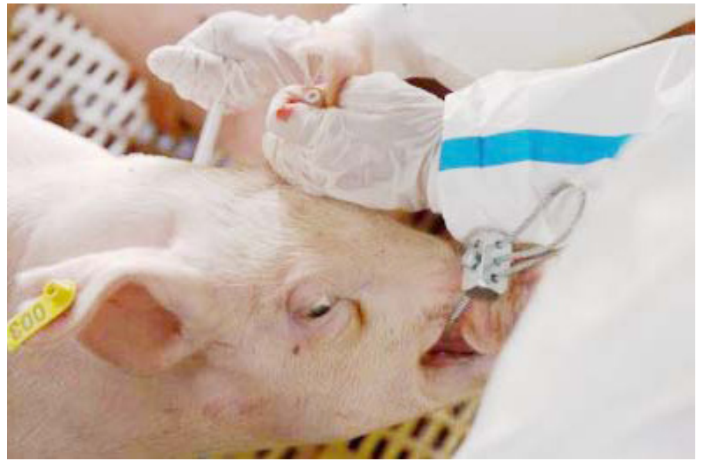
PREVENTION. The Department of Agriculture-Bureau of Animal Industry rolls out the first government-controlled vaccination against African swine fever for healthy pigs in Barangay Malapad na Parang, Lobo, Batangas on Aug. 30, 2024. The DA on Sunday (Sept. 1) said healthy and ASF-negative pigs may be transported from red zones.

As of Aug. 21, there are 458 barangays in 115 municipalities and 32 provinces that are still classified as red zones. (PNA)