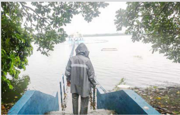
CRITICAL LEVEL. La Mesa Dam in Quezon City reaches water level of 80.03 meters as of 3 p.m. Monday (Sept. 2, 2024), near its spilling level of 80.15 meters. Water from La Mesa Dam, when released, affects low-lying areas along Tullahan River from Quezon City (Fairview, Forest Hills Subdivision, Quirino Highway, Sta. Quiteria, and San Bartolome), Valenzuela (North Expressway, La Huerta Subdivision), and Malabon.

Residents of those areas, especially near the river banks, are advised to be alert