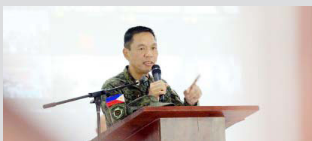
Philippine Army chief Lt. Gen. Roy Galido

Philippine Army (PA) commander Lt. Gen. Roy Galido called on leaders of all the force's reservists to create more units that will beef up their transportation capabilities.