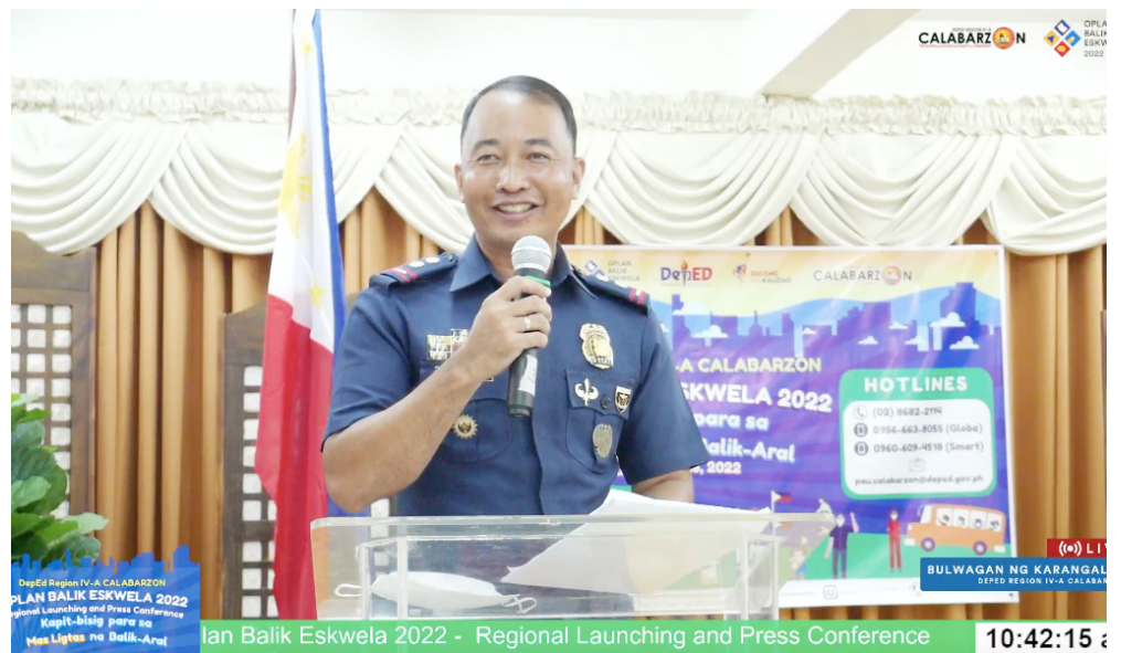
lan Balik Eskwela 2022 - Regional Launching and Press Conference 10:42:15

They also conducted information, communication, and education campaigns (IEC), in cooperation with local government units, na-