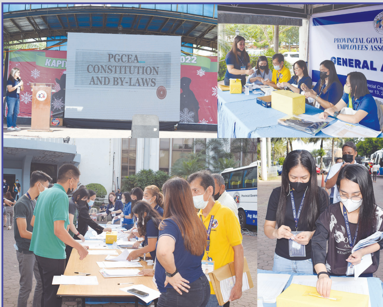
On December 13, 2022, Provincial Government of Cavite Employees' Association successfully held its first general assembly at the Provincial Capitol Grounds, Trece Martires City spearheaded by its interim officers. During the assembly, PGCEA updates were reported to the body. Likewise, the association's Constitution and By-laws was ratified. Upcoming activities were announced including the filing of candidacy and election of new officers.--- PICAD

REPUBLIC OF THE PHILIPPINES FOURTH JUDICIAL REGION REGIONAL TRIAL COURT OFFICE OF THE CLERK OF COURT DASMARINAS CITY, CAVITE