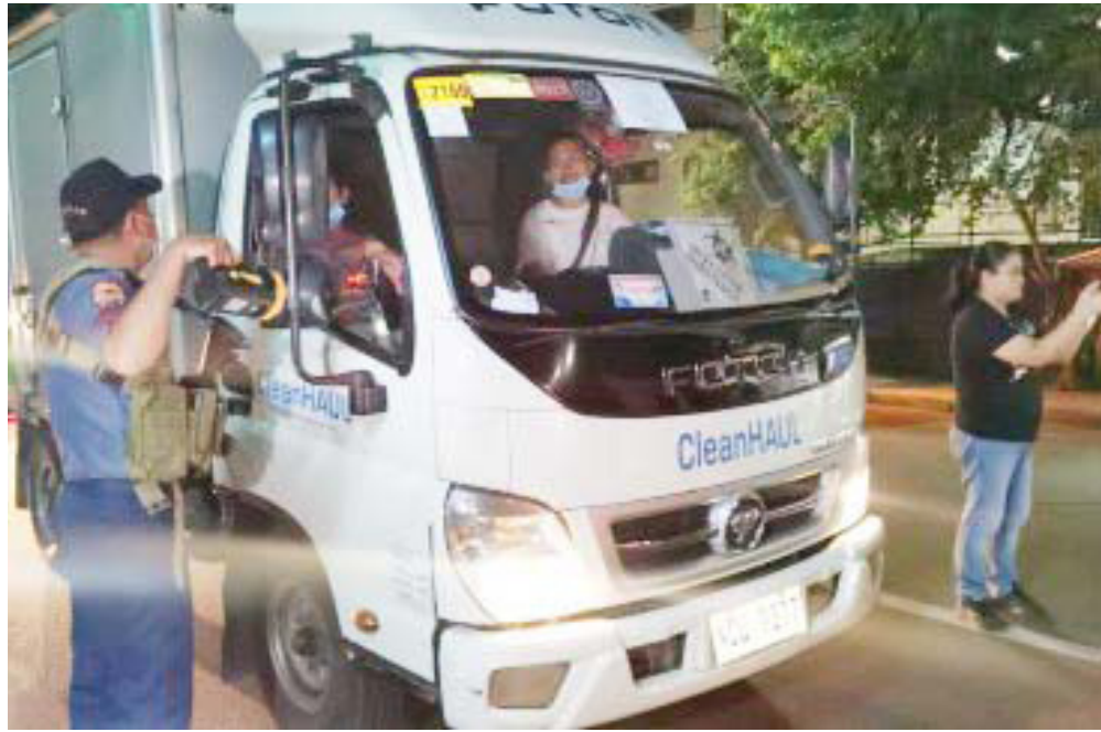
CHECKPOINT. A Cavite policeman is seen inspecting a vehicle at a checkpoint in Trece Martires City in connection with the special election on Feb. 25, 2023. Voters will choose their representative for the 7th Congressional District.

At exactly 12:01 a.m. Comelec checkpoints were put up in strategic locations, including the entrance and exit points of the municipalities of Tanza, Indang,