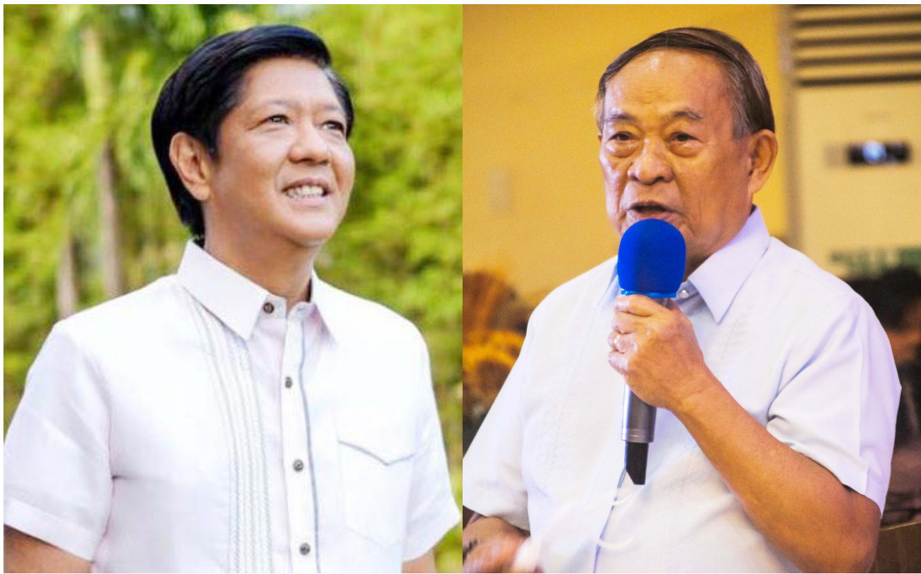
President Ferdinand Romualdez Marcos, Jr.