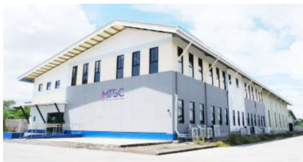
SUPPORT CENTER. This facility located in General Trias, Cavite will provide training on mold-making and accept mold-making jobs. The MTSC was funded by the Korean government and will be managed by the Department of Science and Technology.

The training may last for two months because of the various modules that participants would need to take up. (PNA)