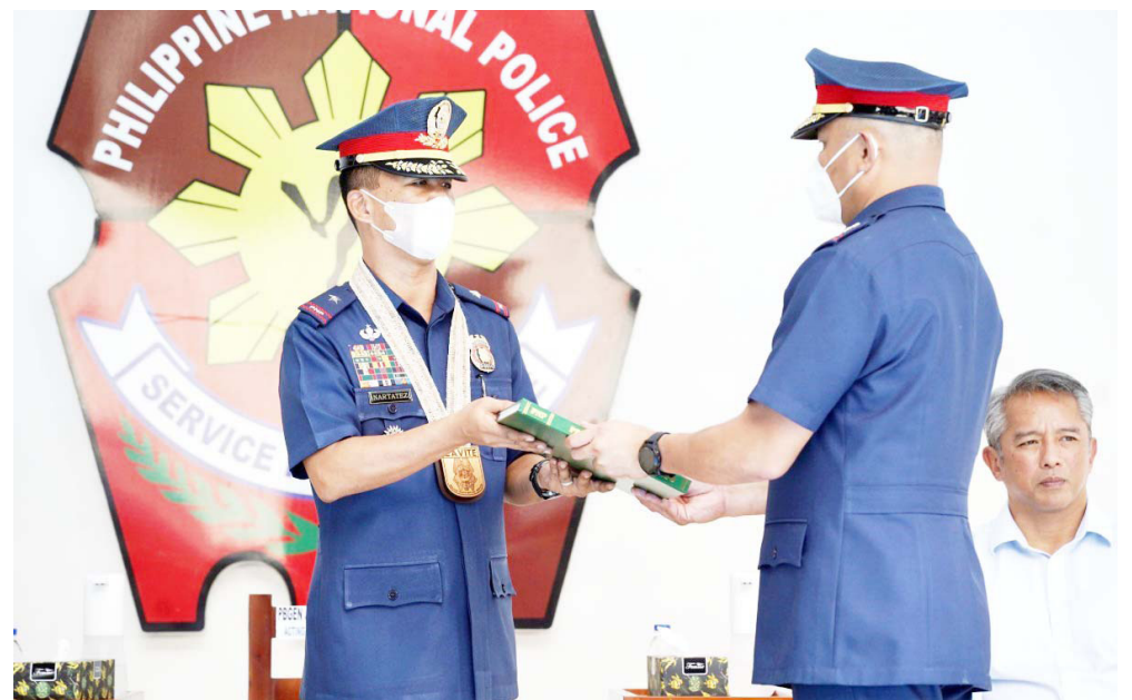
Headquarters to Trece Martires, Cavite, provision of additional Mobile Patrol Cars, housing for PNP Personnel and a proposed PIB for CCTV systems in aid of fighting criminality are included in his priority projects.