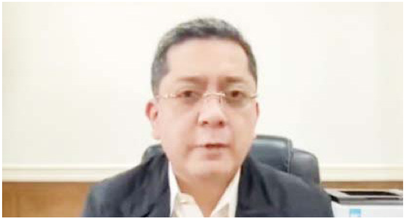
Comelec chairperson George Erwin Garcia (File photo)