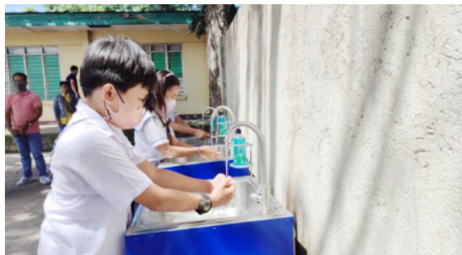
GLOBAL HANDWASHING DAY. Students of nine public schools in Tarlac City will soon have new handwashing facilities to be built through a memorandum of agreement signed by PrimeWater Infrastructure Corp. and the Department of Education (DepEd) Schools Division of Tarlac City for the celebration of the annual Global Handwashing Day on Oct. 15, 2022. The facilities will be constructed through DepEd's Water, Sanitation, and Hygiene in Schools (WInS) program.

PrimeWater Infrastructure Corp. forged a partnership with the Department of Education (DepEd) Schools Division of Tarlac City for the celebration of the annual Global Handwashing Day.