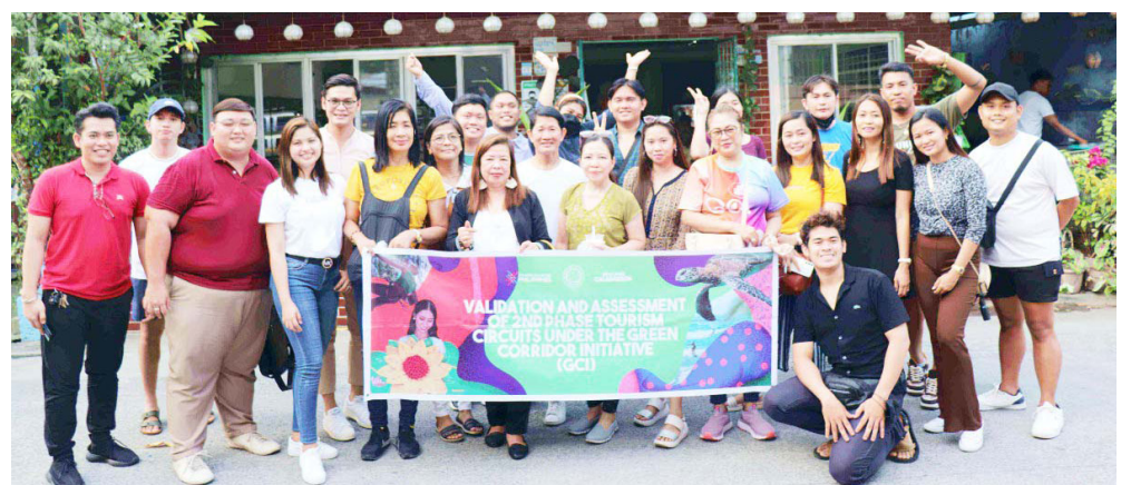
Nagsagawa ng 2-day Calibrated Tourism Circuit Validation and Assessment for Cavite Province ang Department of Tourism (DOT) Region IV-A upang suriin at alamin ang kahandaan ng ilan sa mga tourist destination at attractions sa lalawigan para sa muling pagpapasigla sa industriya ng turismo. (CO/PIA4A)