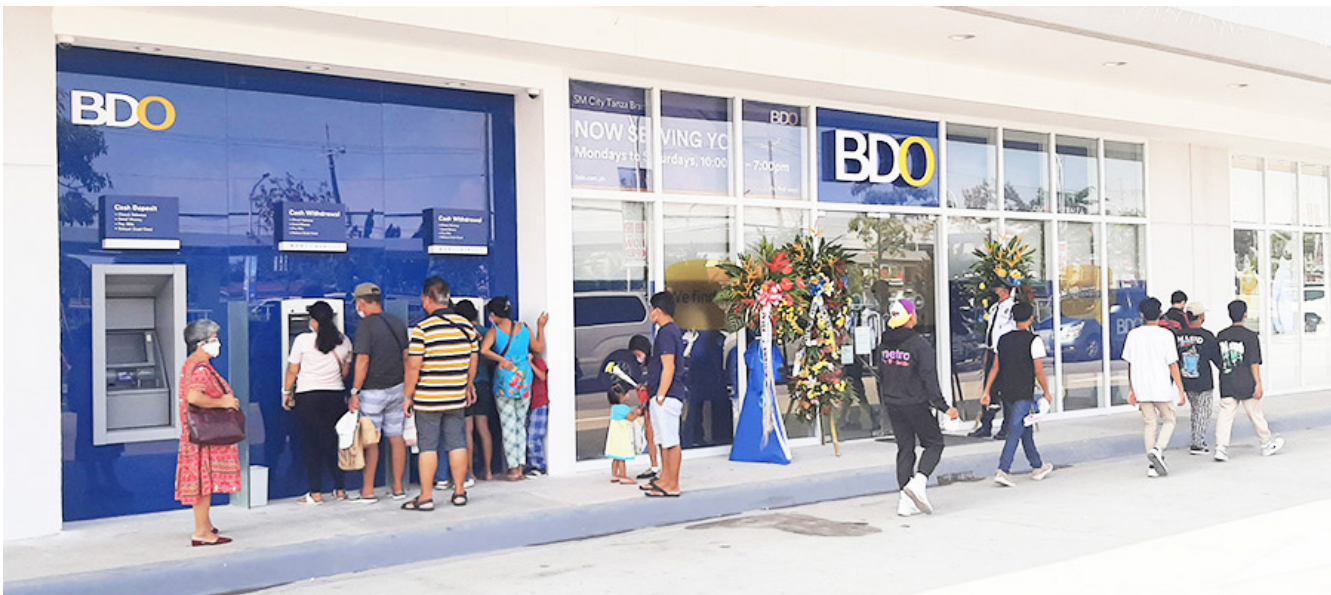
READY TO SERVE. BDO Unibank opened its newest branch located in SM City Tanza to serve the banking needs of families and businesses in the highly urbanized municipality of the province. Today, there are now 46 BDO branches in Cavite and a total of 1,191 branches all over the country.

BDO Unibank recently opened its newest branch in Tanza, Cavite to meet the growing demand for banking solutions by families and businesses situated in the highly urbanized municipality of the province.