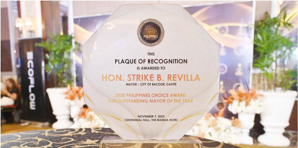
The entire Bacoor community is invited to celebrate this victory, which brings great honor to the city.