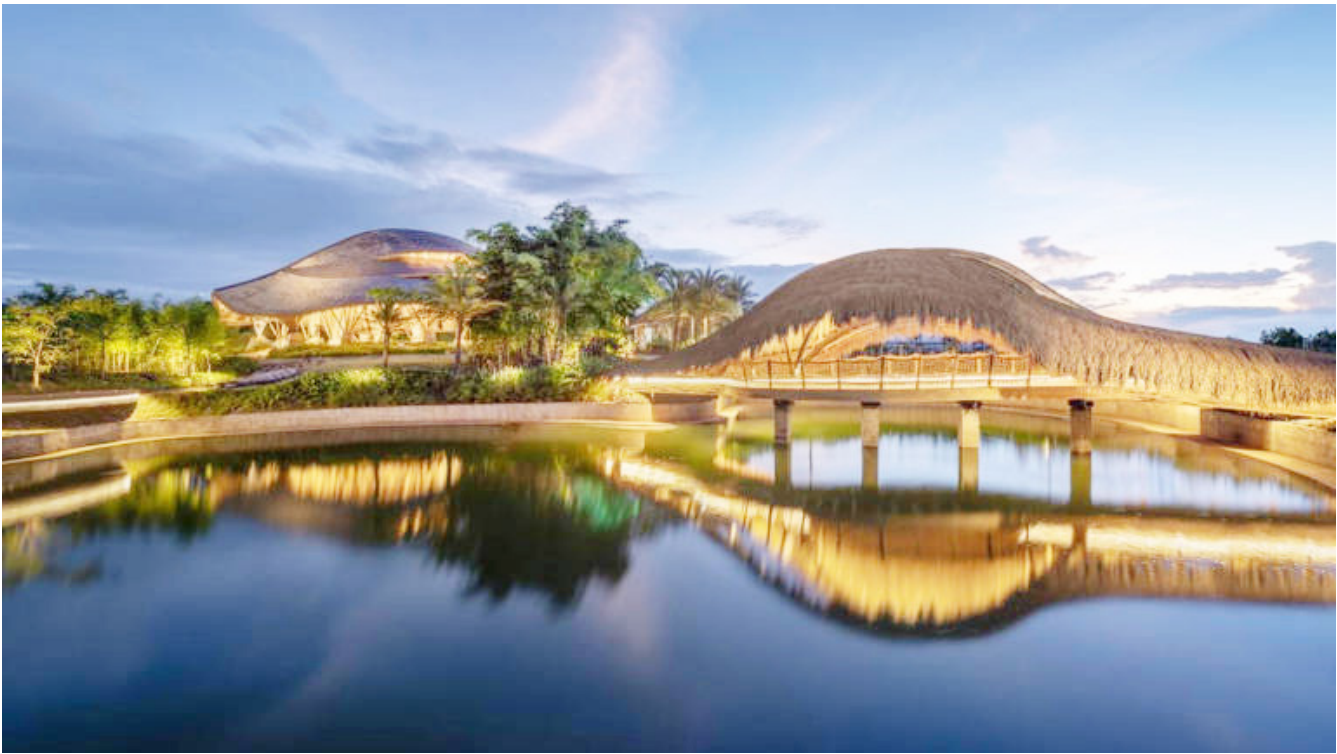
The Kawayan EcoPark. n The author with the organizers, and children and youth during the National Consultation with Children and Youth on the Nationally Determined Contribution and Just Transition.

GENERAL TRIAS, CAVITE — On July 26, Kawayan EcoPark, touted as the largest ecological sanctuary in Luzon that seamlessly blends organic architecture, sustainable materials, and community-driven tourism, officially opened its gates to the public. Nestled within a flourishing bamboo forest, the eco-park showcases a variety of thoughtfully