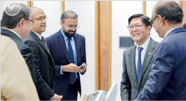
SANGLEY AIRPORT DEV'T. President Ferdinand R. Marcos Jr. (2nd from right) meets with officials of Indian infrastructure company GMR Group, a strategic partner of the Sangley Aerocity Project, on Wednesday (Aug. 6, 2025) at the Taj Mahal Hotel in New Delhi. During their meeting, GMR expressed interest in supporting the Build Better More program.

President Ferdinand R. Marcos Jr. has directed government agencies to ensure "red carpet treatment" for the Sangley Point International Airport project in Cavite, as he reaffirmed support for its fast-tracked development