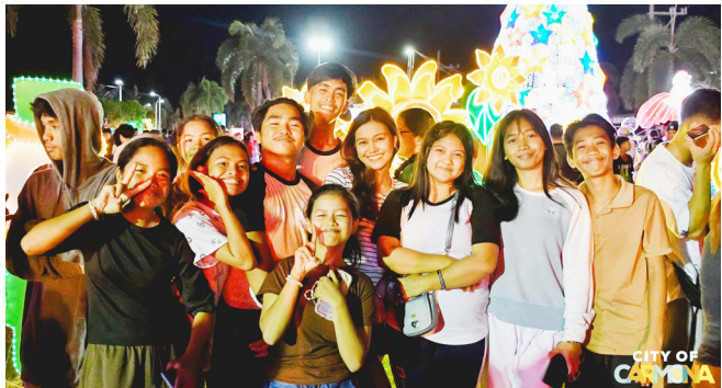
Revelers at the Christmas lighting ceremony at Carmona City Park on Nov. 24

awards, was made possible through the collective efforts and contributions of every resident. “Panatilihin natin ang pagmamahal hindi lang sa loob ng pamilya, kundi sa komunidad na ating ginagalawan (Let us uphold love not only within our families but also in the community where we belong),” the local chief executive said. Attendees enjoyed performances from local artists, including the Carmona Symphonic Band and the Carmona Performing Arts Group. During the event, the local government unit (LGU) announced the updated mechanics for the Sorteo Festival 2025. A long-running triennial event, Sorteo, a Spanish word that means raffle or draw, started in 1861 during the Spanish colonization as a way to raf-