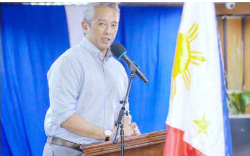
DILG Secretary Jonvic Remulla

The PNP is conducting a thorough investigation of the incident, which occurred near the town hall, she said, adding that police personnel who rushed to the scene were