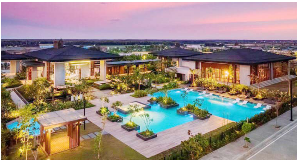
Overview of the Maple Grove clubhouse.

recently presented the new clubhouse of Maple Grove Park Village, the township's residential enclave, ahead of its scheduled turnover to lot owners by May 2026. The project is described as an exclusive resort inspired community.