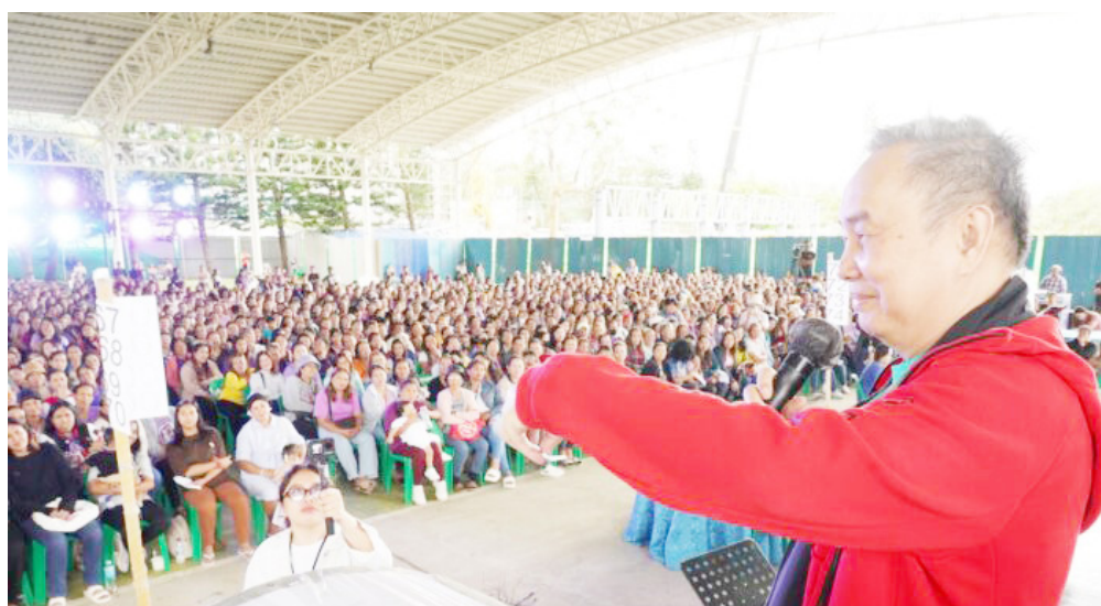
Tagaytay City Mayor Abraham 'Bambol' Tolentino engages with the crowd during an event in Cavite in December 2024.

TAGAYTAY CITY, Cavite—Candidates from Tagaytay City, led by the influential Tolentino family, are among those running unopposed in Cavite for the May 12, 2025 National and Local Elections, according to the Commission on Elections (Comelec).