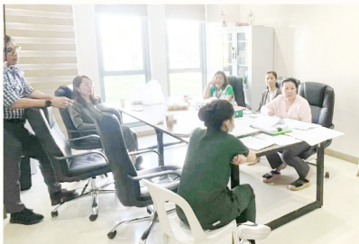
Calamba Medical Center