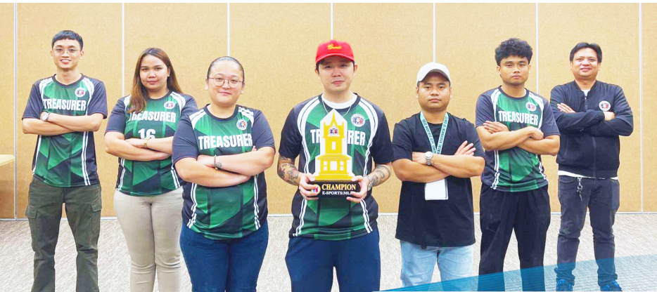
PGC SPORTSFEST 2025 - E-GAMES 14 MARCH 2025 | NEW CAPITOL BUILDING WWW.CAVITE.GOV.PH - WWW.ATHENATOLENTINO.PH

The Mobile Legends tournament, organized by the Provincial Youth and Development Office (PYSDO), concluded with resounding success after four action-packed days of competition from March 7, 11, 13 to 14. A total of 23 teams from various PGC offices showcased their exceptional skills, teamwork, and strategic gameplay as they vied for the coveted trophy. The event highlighted the popularity of Mobile Legends as a premier eSports platform, while promoting unity and camaraderie among participants. The tournament which was part of the ongoing Provincial Government of Cavite employees' sports fest provided PGC employees the opportunity to bond and demonstrate teamwork. After the intense battles, four team emerged as winners. The champions of the tournament were the combined teams from the Office of the Provincial Treasurer and the Office of the Provincial Information Office. The first runner-up was the Office of the Provincial Health Officer, followed by the Office of the Provincial Engineer as the second runner-up. The third-place finishers were the team from the Office of the Sangguniang Panlalawigan. This event has paved the way for future eSports tournaments within the PGC. — F. Tamio