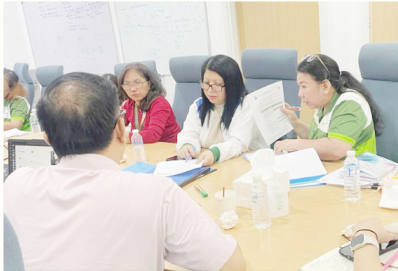
The Medical City South Luzon