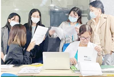
Healthway Qualimed Hospital

Local Health Insurance Office Calamba conducted a Stakeholder Engagement Activity: Meeting and Site Acceptance Test with the officers in various facilities regarding the Z Benefit package.