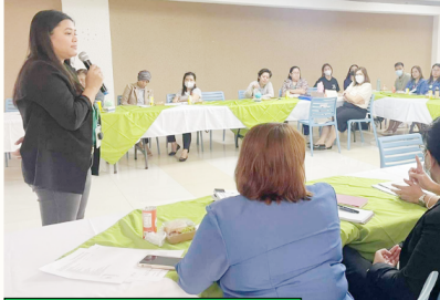
Global Care Medical Hospital