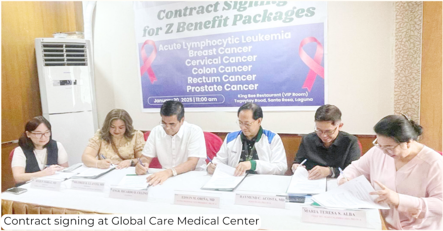
Contract signing at Global Care Medical Center

The Mobile Legends tournament, organized by the Provincial Youth and Development Office (PYSDO), concluded with resounding success after four action-packed days of competition from March 7, 11, 13 to 14. A total of 23 teams from various PGC offices showcased their exceptional skills, teamwork, and strategic gameplay as they vied for the coveted trophy. The event highlighted the popularity of Mobile Legends as a premier eSports platform, while promoting unity and camaraderie among participants. The tournament which was part of the ongoing Provincial Government of Cavite employees' sports fest provided PGC employees the opportunity to bond and demonstrate teamwork. After the intense battles, four team emerged as winners. The champions of the tournament were the combined teams from the Office of the Provincial Treasurer and the Office of the Provincial Information Office. The first runner-up was the Office of the Provincial Health Officer, followed by the Office of the Provincial Engineer as the second runner-up. The third-place finishers were the team from the Office of the Sangguniang Panlalawigan. This event has paved the way for future eSports tournaments within the PGC. — F. Tamio