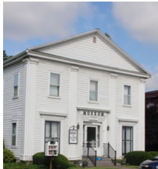
Groton Historical Association

August 1, 2026 7:00 am - 10:00 am Groton Fire Department 308 Main St. Groton, NY