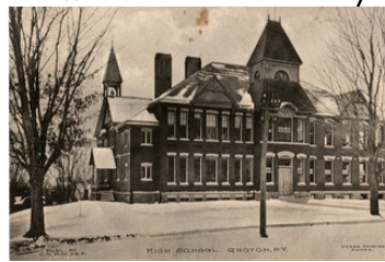
Union Free School constructed after fire in 1882