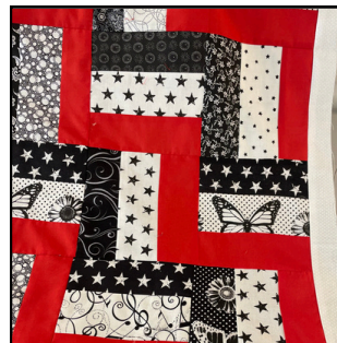
Flo Allen Quilt