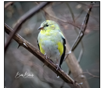
Buddy Belonsoff Print