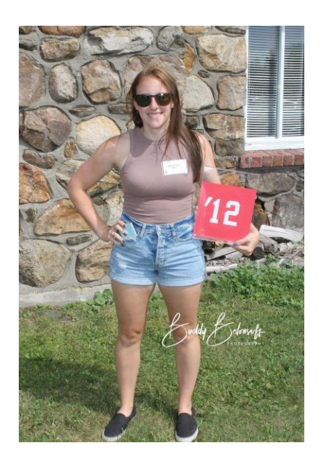
Class of 2012