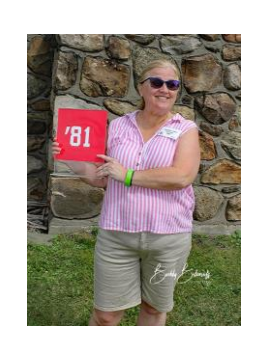
Class of 1981