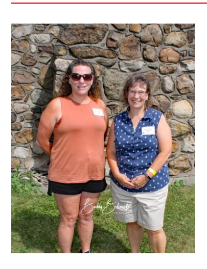
Class of 1986