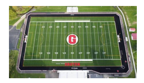
The field runs north and south. The old field was east and west.

There is also a softball diamond to the left.