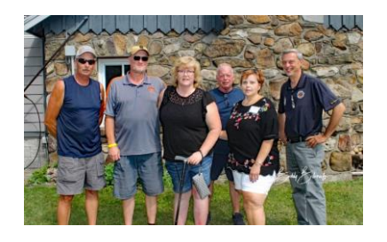
Class of 1983