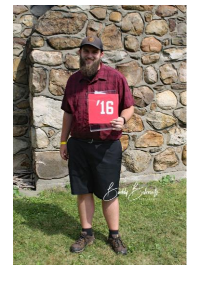
Class of 2016