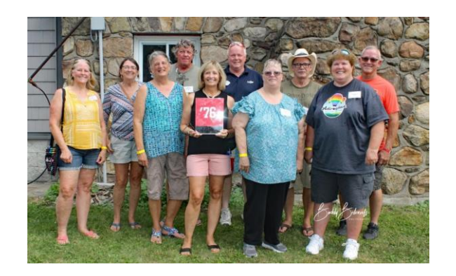
Class of 1976