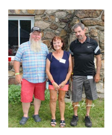
Class of 1977