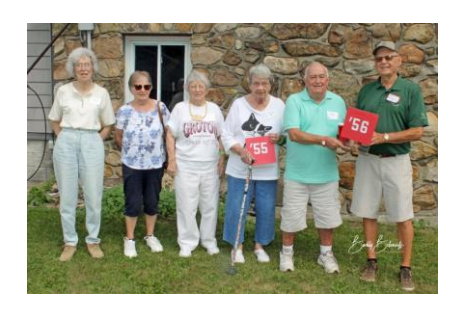
Class of 1955 and 1956