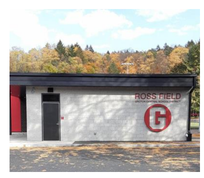
There are 2 paved parking lots, one on South Main and the other is off from Baken Ave.

There is also a softball diamond to the left.