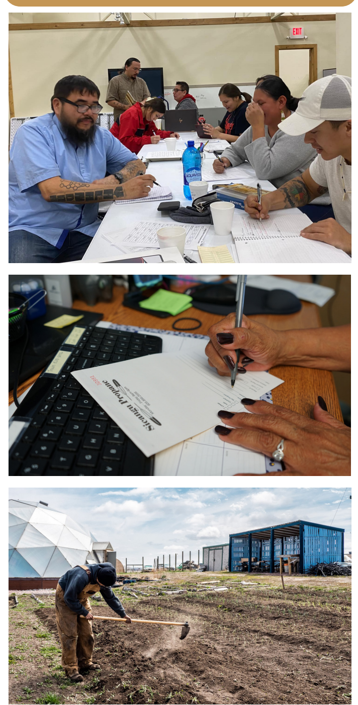
Come join the over 60 team members employed throughout our ecoystem made up of Sicangu CDC, Tatanka Funds, and REDCO. We have various positions open that you can apply for right now. To learn more and apply, go to www.sicangucorp.com/ careers or scan the QR code below.