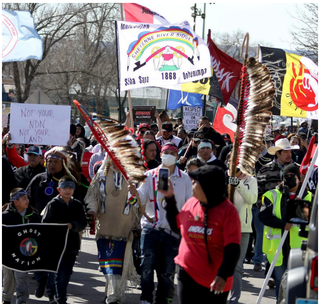
Citizens and allies of Oceti Sakowin gather to protest against a local business's racist remarks concerning Native Americans.