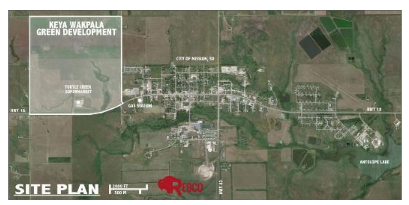
Location of the Keya Wakpala Green Development on 590 acres adjacent to and west of Mission, SD. Map source: <a href="http://www.sicanguscribe.com/keya-wakpala.html">http://www.sicanguscribe.com/keya-wakpala.html</a>

The REDCO CSFI plans to expand and grow both in the Mission area and throughout the Rosebud Reservation. At the site of the Turtle Creek grocery, REDCO has plans to develop a trail network promoting exercise and native plant species education that links the grocery store with the community garden, the farmers market, nearby homes, future commercial sites, and natural features of the nearby wetlands area. The trail system will highlight native edible plants found in the traditional Lakota diet.