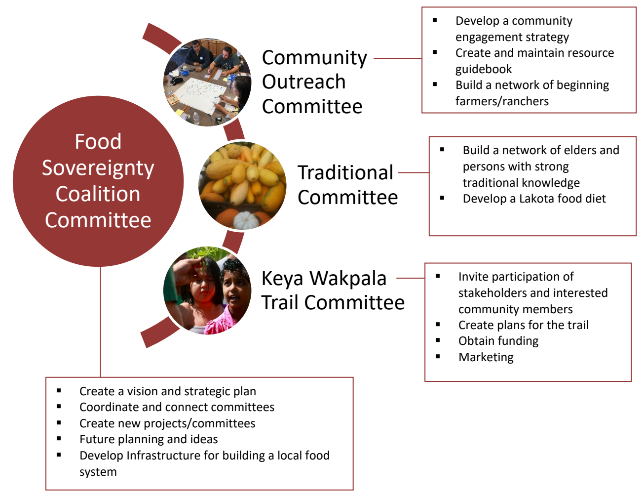
Figure 5 - Food Sovereignty Coalition Committee Structure