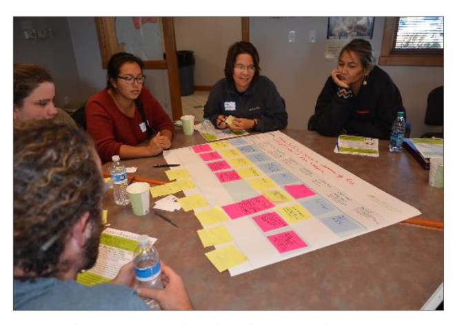
LFLP work session on the last day, the action planning matrix.

For any action plan to be implemented successfully, a strong and robust food sovereignty coalition must be formed to direct, oversee, and perform the work needed to be done, supported by sub-committees focusing on specific goal areas. The top priority is a committee that will endeavor to formally create a reservation-wide Food Sovereignty Coalition, which would bring together various community members and programs and increase communication, collaboration and capacity of community food work. This group will consist of community leaders, elders, youth, members with knowledge of traditional foods, and various organizations that work with food and healthrelated issues on the Rosebud Reservation.