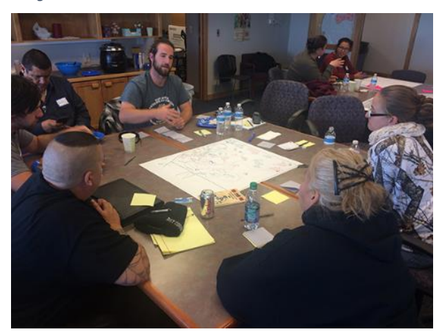
During the design exercise, community members discussed potential ways in which community food sovereignty could be furthered through a trail and other outdoor spaces at the Keya Wakpala development.

Throughout the workshop much discussion was around how to improve and increase community participation, dialogue, and engagement. To engage on the initiatives around this topic, another subcommittee would be created. The biggest gap in representation is among the youth and elders of the community. The general outline of a coalition structure, including subcommittees and jurisdictions of each subcommittee, are summarized in the diagram below, and some of the initiatives of each committee placed into action plan tables. Some of the tables remain incomplete as they will need to be visited and completed by future persons serving on these committee. The first coalition committee meeting was scheduled for January 9, 2017.