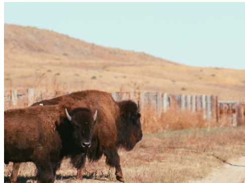
The first of 60 buffalo emerge.

Tatanka and the Lakota once walked together from Wind Cave. Though both populations have experienced hardship they are once again joining forces, this time, to bring about climate, economic, and social justice.