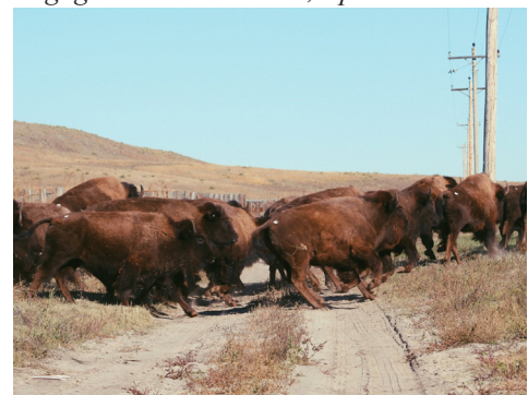
The 60 buffalo make their way to their new home.