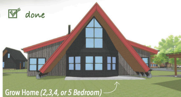
Grow Home (2,3,4, or 5 Bedroom)