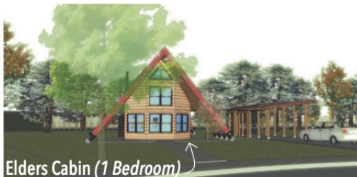
Elders Cabin (1 Bedroom)

4 Unique House Design and Sizes to Choose From done