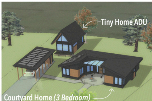
Courtyard Home (3 Bedroom)