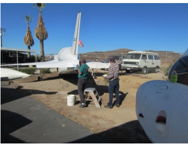
Paint touchup on DP-1 tail