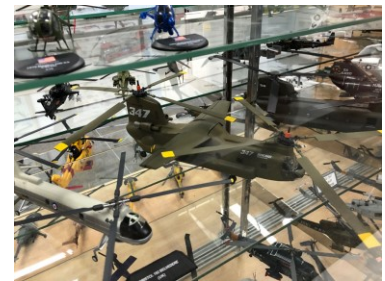
Boeing 347 model