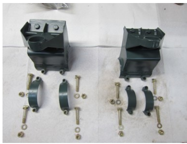
HRP blade fold mount brackets

So it's the end of another year, it seems like it went by so fast. At least the weather cooled down and we even got some rain, quite a bit actually. With days getting shorter at the end of the year, it gets dark and cold early. The hangar is well lit with LED overheads but sort of an icebox with colder weather making work into the late afternoon difficult. In spite of the cold, dark and wet quite a bit got done on the Rescuer, Huey, Mojave and Cloud-Buster (just testing your name knowledge). Along with the aircraft work, we also got things accomplished on several other projects including a couple of new items which I'll share at the end.