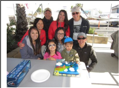
Future pilot birthday party

including a Siller Helicopters Sikorsky SH-3A and a PJ Helicopters UH-60A Utility Hawk. Weather during