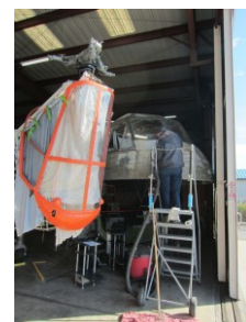
H-37 nose cleaning

Blade fold mount brackets were made, painted and installed on the HRP Rescuer. The brackets will allow us to fold the blades once we've mounted them on the heads. In addition to the brackets, the battery was charged up and the rear frame-work paint touched up. On the HH-1N Huey, one set of the ground handling wheels were disassembled, reworked with new bearings, painted and reassembled. In addition the port cockpit and cabin door cleaning was completed with great results. Lots of cleaning was done on the CH-37B Mojave. The cleaning included the cabin, cabin padeyes and magnesium skin on the nose. On the DL-125 De Lackner Cloud-Buster work was done on the landing gear. Welding repair was done on the left front gear strut and the wheels installed. One of the tail wheel struts was repaired, painted and the wheel installed. Finally, some touchup painting was done on the DP-1 tail.