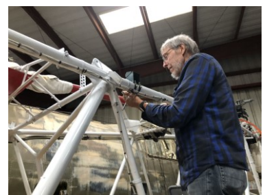
Installing HRP blade brackets