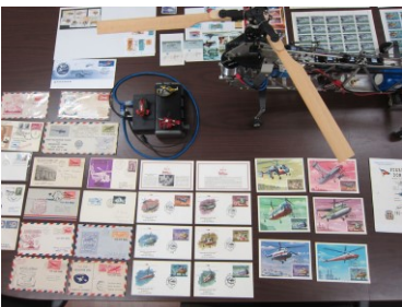
International helicopter stamps