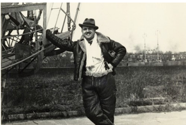
Helicopter Pioneers Video

In other project areas, computer data bases were updated for the HH-52 and maintenance manuals. The HH-52 restoration timeline was reviewed and reorganized to account for work on the main transmission, rotor head and blades, tail rotor blades and cockpit instrument panel and right chin bubble. The data base manual pdf's were updated for maintenance, technical and flight publications. Work in the model room included reviewing the rotor system cutaway posters for the possible helicopter rotor systems: single main with tail rotor, tandem, coaxial, intermeshing, side-by-side and tilt rotor systems. New custom-made models are displayed including the: HRP, Boeing 347, VS-300 and R-4. Other new models displays include the V-22 Osprey in its different phases and the USS Peleliu (LHA-3) an amphibious assault aircraft carrier. Also in work is organizing a helicopter stamp collection comprised of hundreds of stamps from all over the world. An especially unique project is the production of two museum specific videos. The first is a podcast telling the inspiration, formation and objectives of Classic Rotors. The second is a production of the U. S. helicopter pioneers: Igor Sikorsky, Frank Piasecki, Arthur Young, Stanley Hiller, Charlie Kaman and Frank Robinson. Both videos are just over an hour long each and well worth the price of admission. I have included links to them at the end of this Happenings.