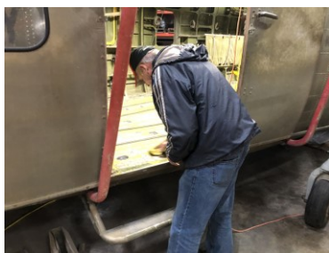
Cleaning H-37 cabin padeyes

Blade fold mount brackets were made, painted and installed on the HRP Rescuer. The brackets will allow us to fold the blades once we've mounted them on the heads. In addition to the brackets, the battery was charged up and the rear frame-work paint touched up. On the HH-1N Huey, one set of the ground handling wheels were disassembled, reworked with new bearings, painted and reassembled. In addition the port cockpit and cabin door cleaning was completed with great results. Lots of cleaning was done on the CH-37B Mojave. The cleaning included the cabin, cabin padeyes and magnesium skin on the nose. On the DL-125 De Lackner Cloud-Buster work was done on the landing gear. Welding repair was done on the left front gear strut and the wheels installed. One of the tail wheel struts was repaired, painted and the wheel installed. Finally, some touchup painting was done on the DP-1 tail.