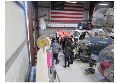
Engineering school tour

So hop into your personal conveyance and start off 2020 by checking out the museum which has an H-43A awaiting your inspecting as well as a magnificent model room. And, while you're waiting to do that, check out these Classic Rotors videos. You won't be disappointed.