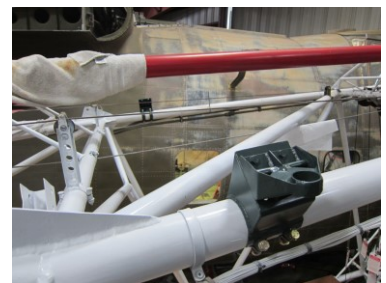
HRP blade bracket installed