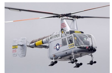
Kaman HH-43B Pedro