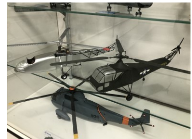
VS-300 and R-4 models