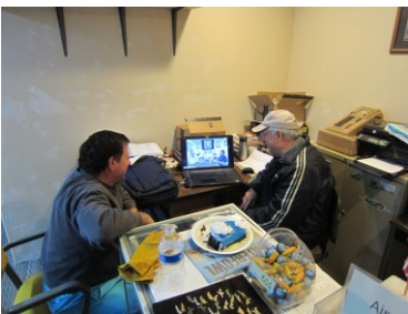
Watching CR Podcast