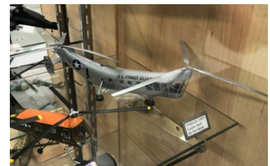
Piasecki HRP model