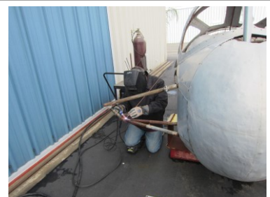
Welding the DL-125 nose gear