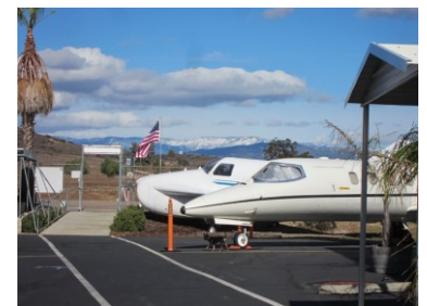
Snow on the distant mountains