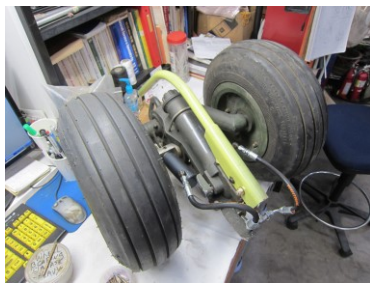
H-1N ground handling wheels