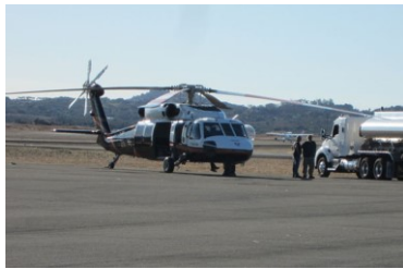
PJ Helos UH-60A fire bomber