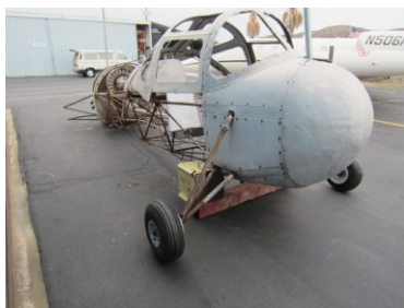
DL-125 nose wheels installed