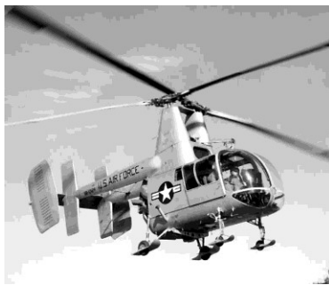
Kaman H-43A Huskie

this period gave us some magnificent cloudscape as well as snow on the surrounding mountains.