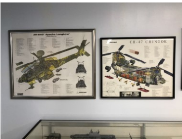
Rotor system cutaway posters