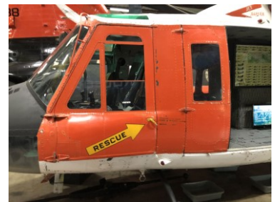
H-1N cockpit door cleaned