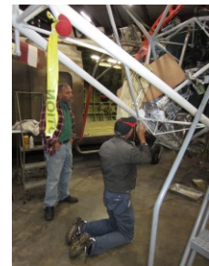
Painting HRP frame