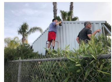
Forklift cover work