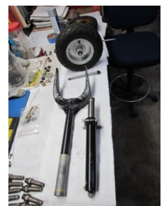
DL-125 tail gear