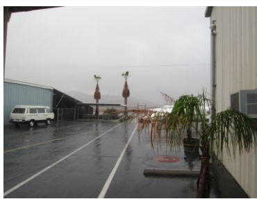
A cold rainy day at the museum