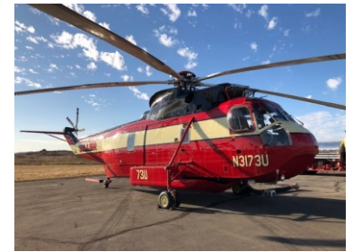
Siller Helos SH-3A fire bomber