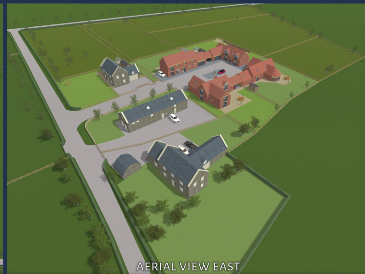
AERIAL VIEW EAST