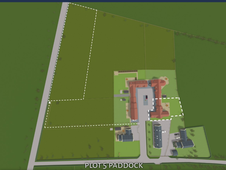
PLOT 5 PADDOCK