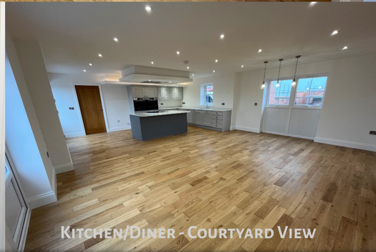
KITCHEN/DINER - COURTYARD VIEW