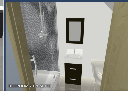
BEDROOM 2 EN-SUITE