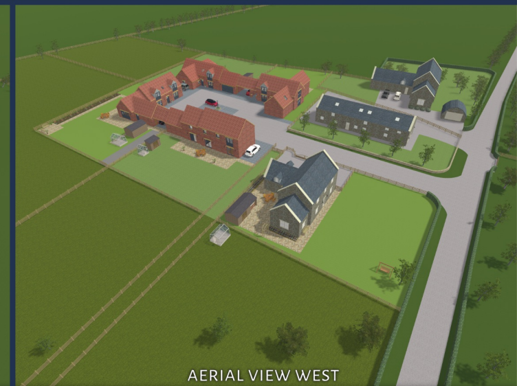
AERIAL VIEW WEST