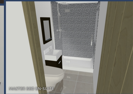
MASTER BED EN-SUITE